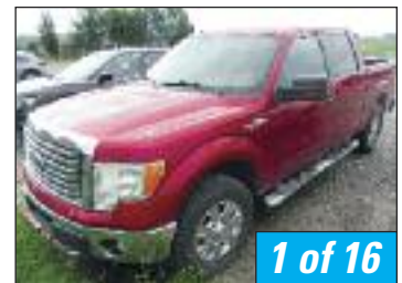
Ford F-150 Pickup Truck