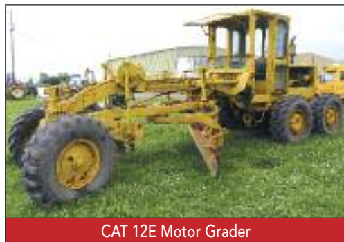
CAT 12E Motor Grader