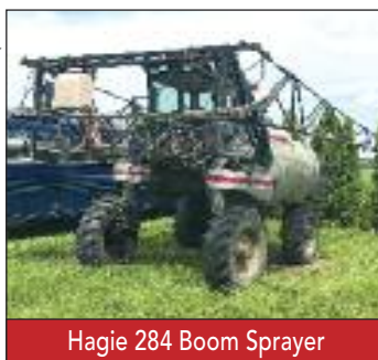
Hagie 284 Boom Sprayer