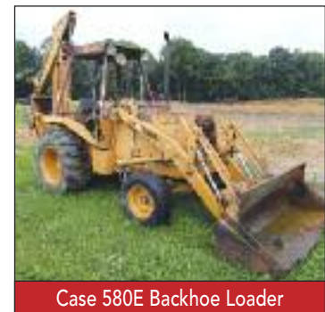
Case 580E Backhoe Loader