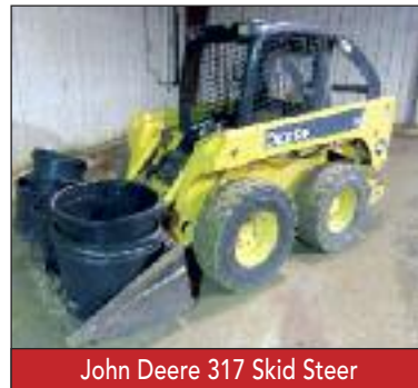
John Deere 317 Skid Steer