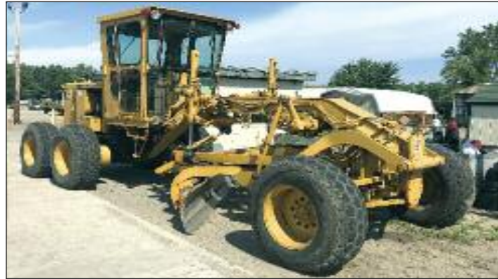
CAT 120G Motor Grader