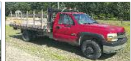
Chevy 3500HD Flatbed Truck