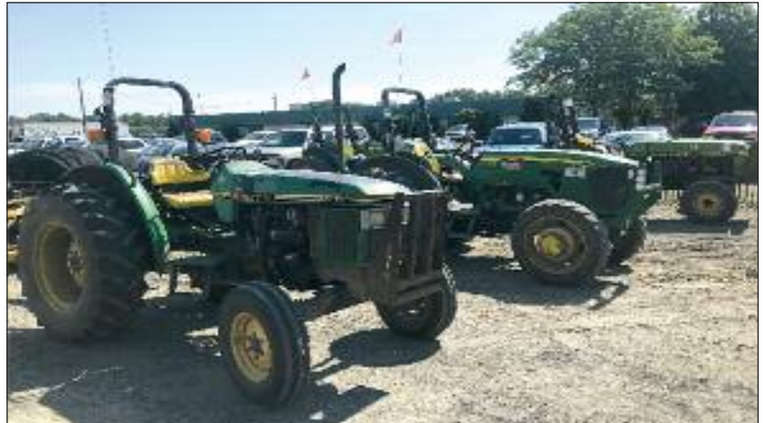
Partial View of Tractors