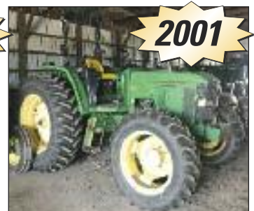
John Deere 6410 Tractor