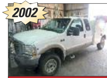
Ford F-250 Maintenance Truck