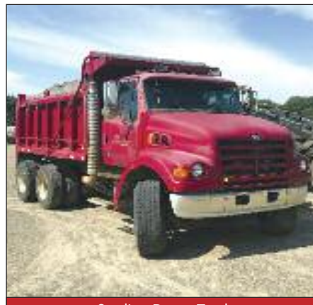
Sterling Dump Truck