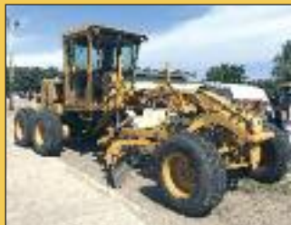
CAT 120G Motor Grader

LIVE PLANT AUCTION: Wednesday, August 8th – 10:00am (EDT) EQUIPMENT AUCTION: Thursday, August 30th – 10:00am (EDT)