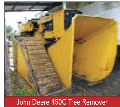
John Deere 450C Tree Remover