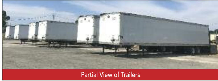
Partial View of Trailers