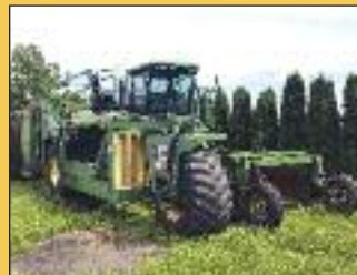
Vogel Root Digger