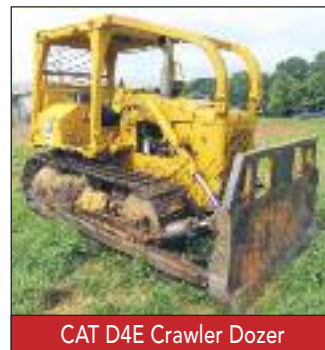
CAT D4E Crawler Dozer