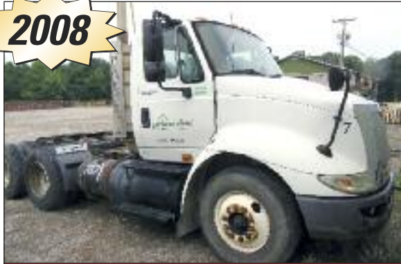
International 8600 Transtar