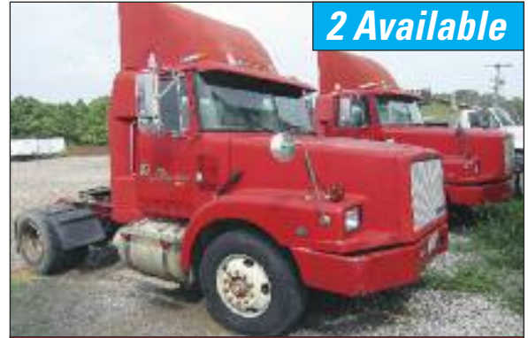
(2) Volvo Day Cab Tractors