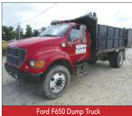
Ford F650 Dump Truck