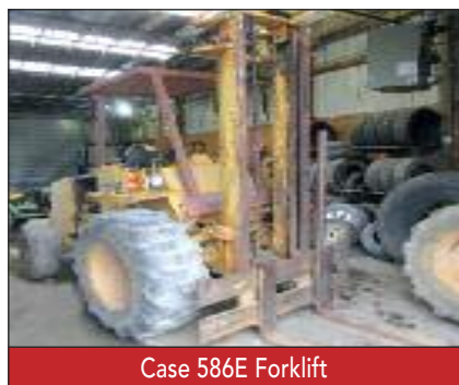
Case 586E Forklift