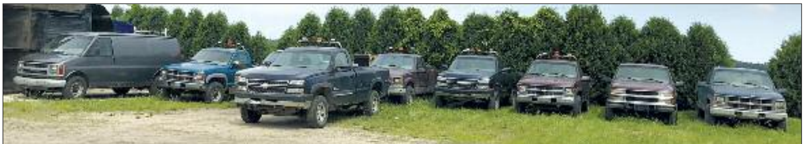
View of Vehicles