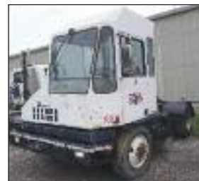
Magnum Yard Switcher Truck