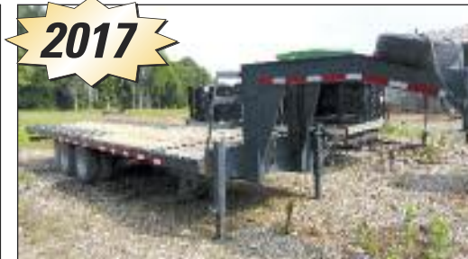
Better Built 25' Tilt Deck (10 Ton) Gooseneck Trailer