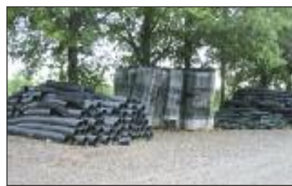
View of New and Used Pots