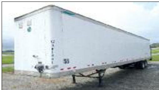
Great Dane 53' Van Trailer w/Lift Gate