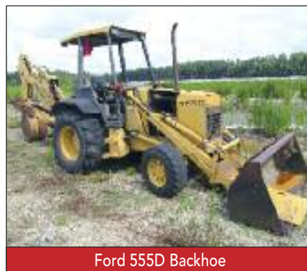
Ford 555D Backhoe