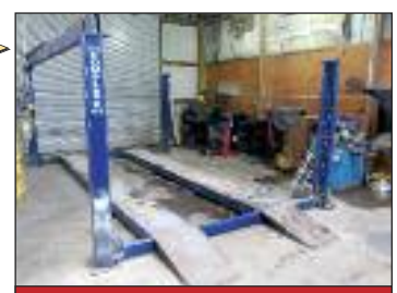
14,000 Lb. Cap. 4-Post Vehicle Lift