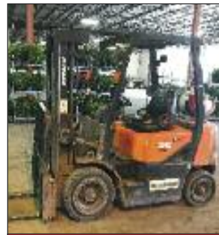
Doosan 25GX Forklift