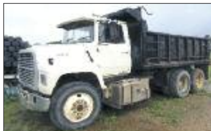
Ford L9000 Dump Truck