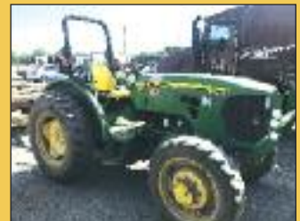
John Deere 5065 M Tractor