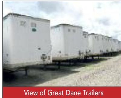
View of Great Dane Trailers