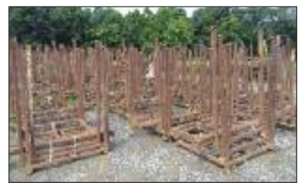
View of Bear Root Tree Racks