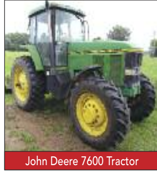
John Deere 7600 Tractor