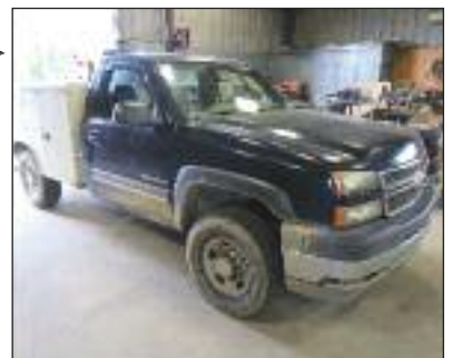
Chevy 2500 Pickup Truck