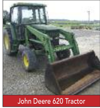
John Deere 620 Tractor