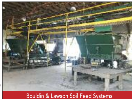
Bouldin & Lawson Soil Feed Systems