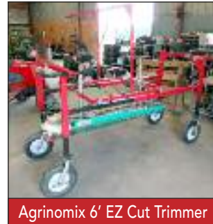
Agrinomis 6' EZ Cut Trimmer

The Plant Inventory at the Site will be Sold after the Equipment.