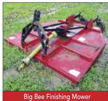
Big Bee Finishing Mower