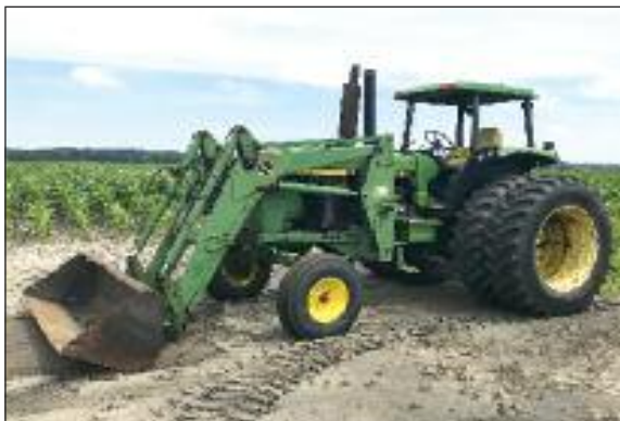
John Deere 265 Tractor