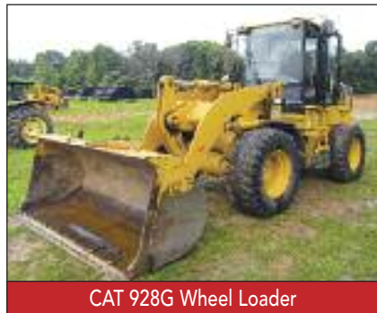
CAT 928G Wheel Loader