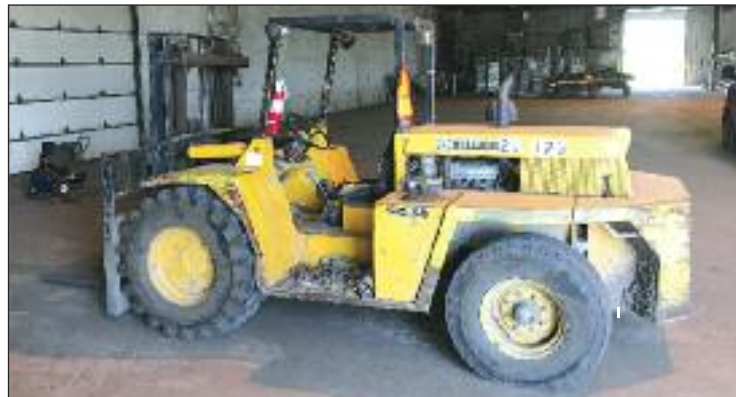
Sellick SG-50 Forklift