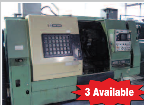
MORI SEIKI SL-35B CNC Turning Center