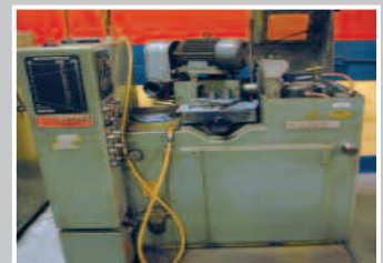
MIKRON A62/0 Gear Hobber