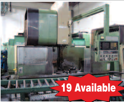
MORI SEIKI MV-55 CNC VMC