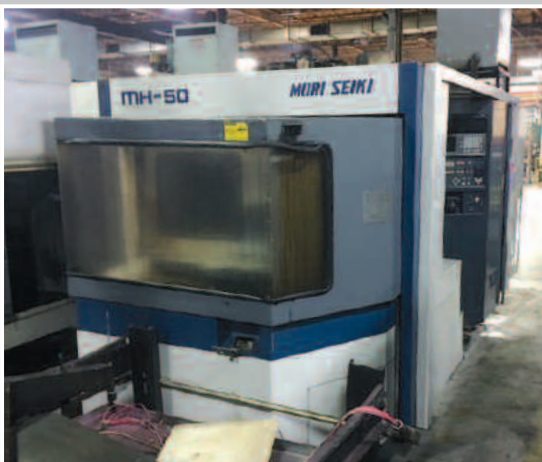
MORI SEIKI MH-50 CNC HMC