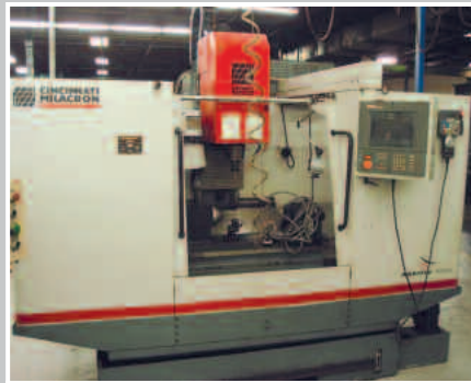
CINCINNATI Arrow 1000 CNC VMC