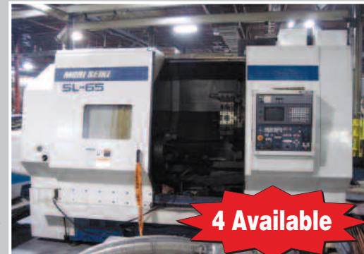
MORI SEIKI SL-65 CNC Turning Center