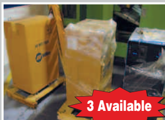
MILLER Access 675 Welders