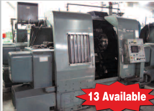
MORI SEIKI SL-6 CNC Turning Center