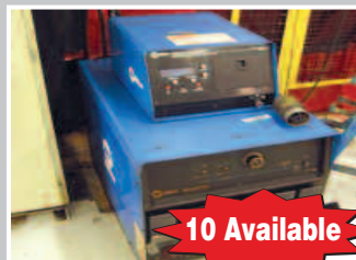
MILLER 652 Welder