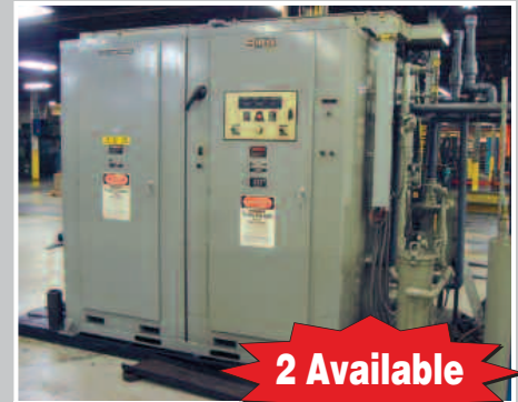
AJAX Tocco Pacer