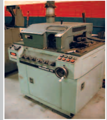
G&L HR Auto. Drill Point Grinder