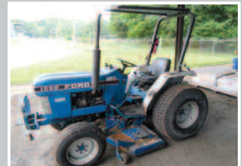
FORD 1520 Tractor