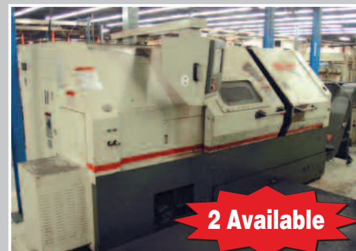
CINCINNATI Falcon 300 CNC Turning Center