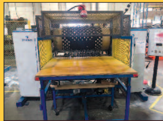
Tridien Anatomic Convoluter