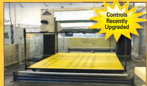
Baumer OFS-HE3 CNC Horizontal Contour Cutter