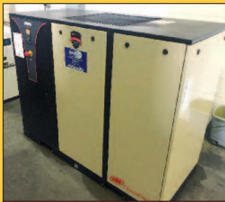
I-R 25 HP Air Compressor