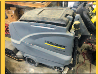
Karcher Walk-Behind Floor Scrubber

Complete Photos & Lot Listings at www.biditup.com