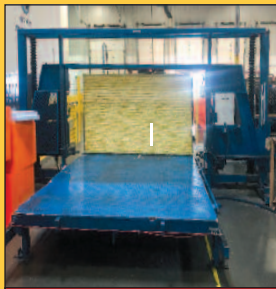
Ferry Int'l Horiz. Bandsaw