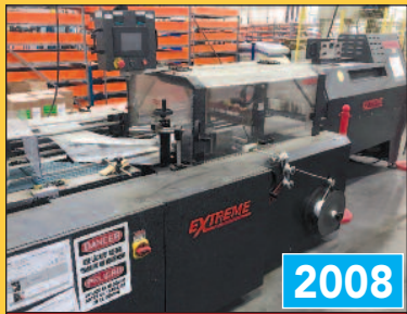
Extreme Packaging Shrink Wrapper

FEATURING: CNC Contour Cutting, RF Welding, Sewing, Band-Sawing (Vertical/Horizontal), Water-Based and Solvent Based Lamination, Punch Pressing, Convoluting, Compression Cutting, Heat-Shrink Packaging, Sealers, Labelling and Plant Support Equipment