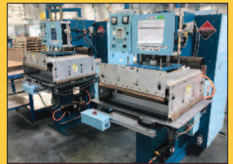
Hall Dielectric RF Welders