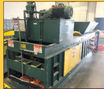
Int'l. Baler Corp. Foam Baler