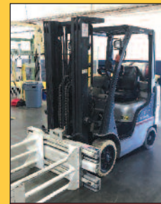
Nissan LP Forklift