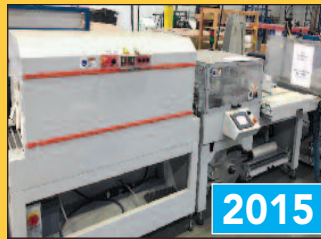
Clamco Auto. L-Bar Sealer