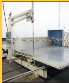
Ferry B-300 Splitter/Saw