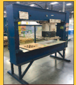
USM P1 Punch Press