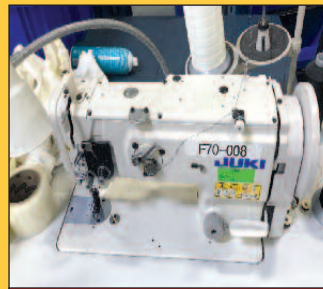
Juki DNU-1541 Sewing Machine