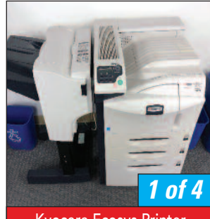
Kyocera Ecosys Printer