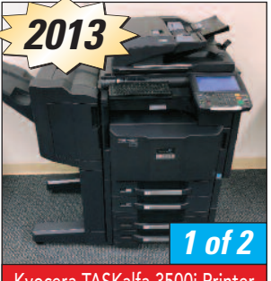
Kyocera TASKalfa 3500i Printer