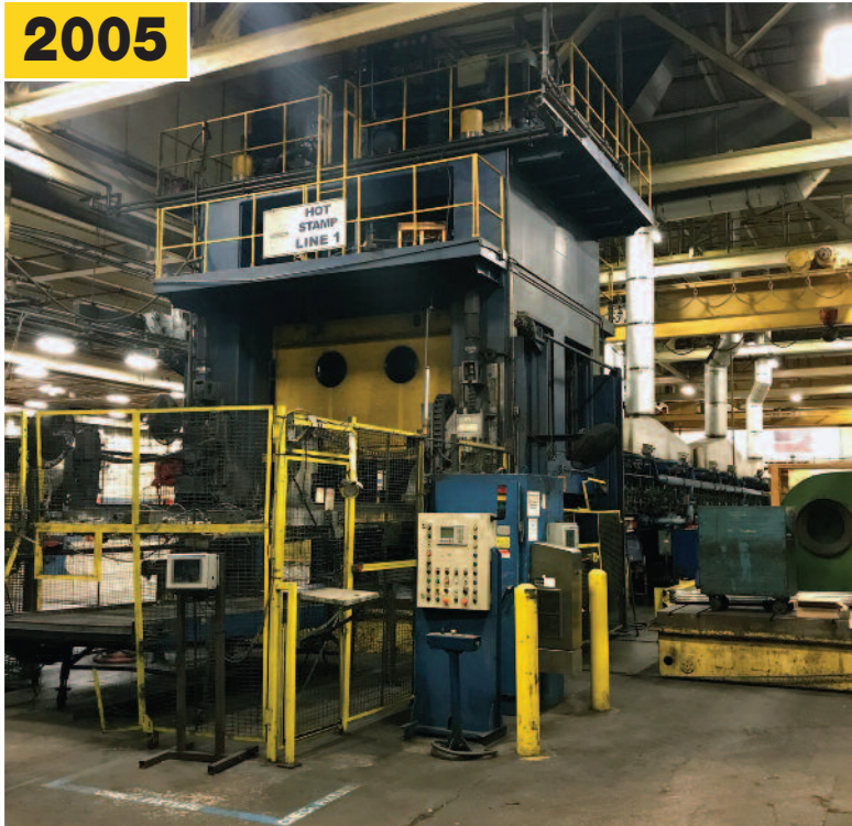
ISGEC Hydraulic & Hot Stamping Press