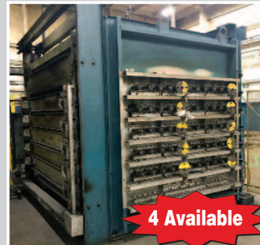
GREAT LAKES SMG Furnaces