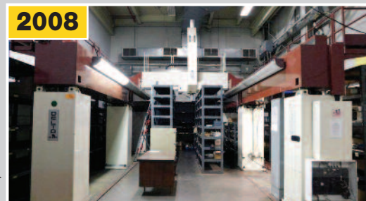
DEA Delta CMM