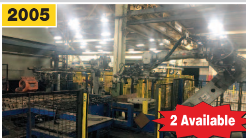
MOTOMAN HP165 Robots