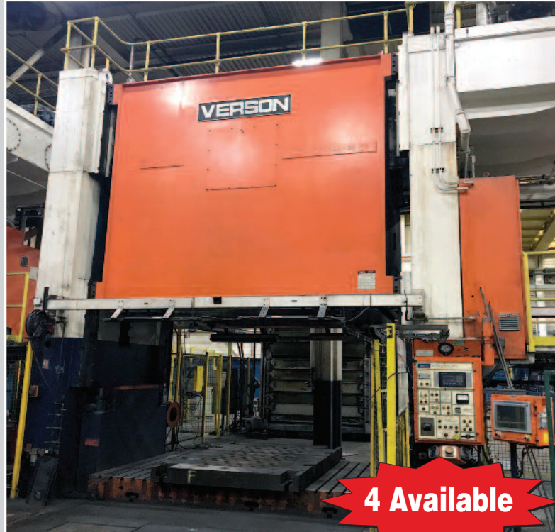
VERSON 500-Ton Hydraulic & Hot Stamping Press