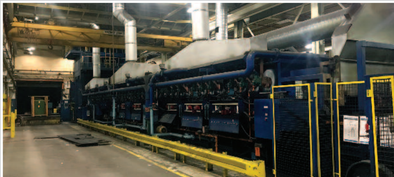
GASMAC 90ft. Walking Beam Gas Furnace