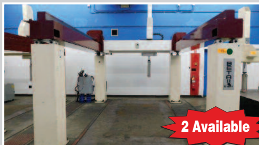
DEA Beta II CMM