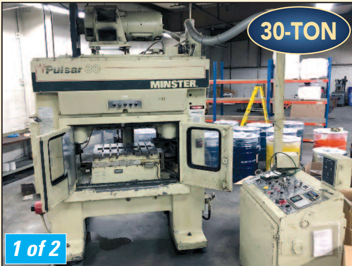
30-TON MINSTER PULSAR TR2 HS PRESS

AUCTION: Tuesday, May 14th at 10:00am PDT LOCATION: 4651 Brooks St., Montclair, CA 91763 PREVIEW: May 9th, 10th & 13th, 9 to 4 or by Appt.