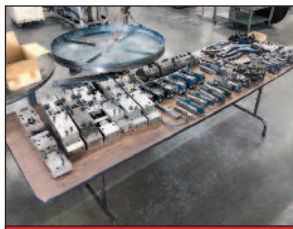
View of Fourslide Tooling