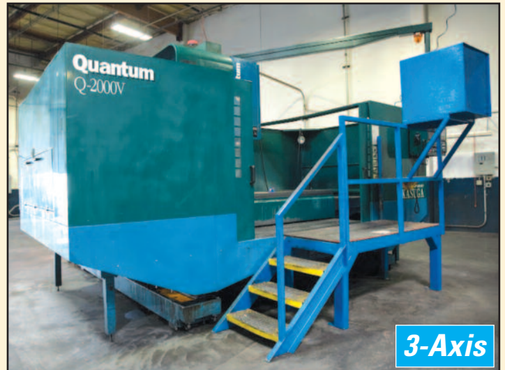
KASUGA QUANTUM 3-AXIS CNC VMC, 62" X 34" X 28" TRAVELS

AUCTION: Tuesday, May 14th at 10:00am PDT LOCATION: Huntington Park, CA PREVIEW: By Appt. Only. Please Call 818.508.7034