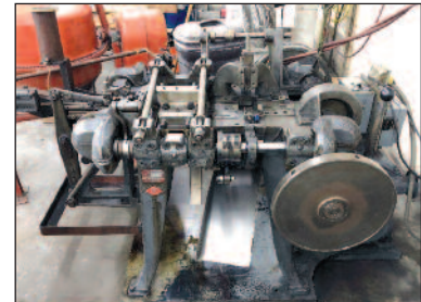
Nilson 0-F Wire Former