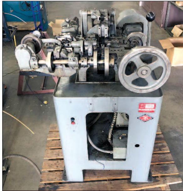
Nilson S-00 Wire Former