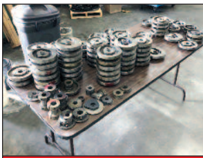
View of Fourslide Cams