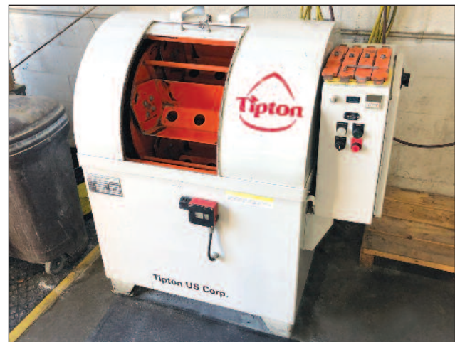
Tipton 30 Liter Barrel Finisher

Register at www.BIDITUP.com and receive auction updates via email