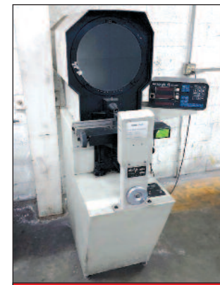
Micro-Vu Optical Comparator

TO SCHEDULE AN AUCTION OR APPRAISAL CALL 818.508.7034