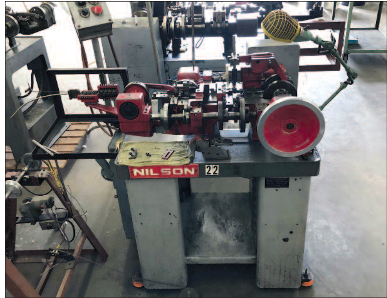
Nilson 700 Wire Former