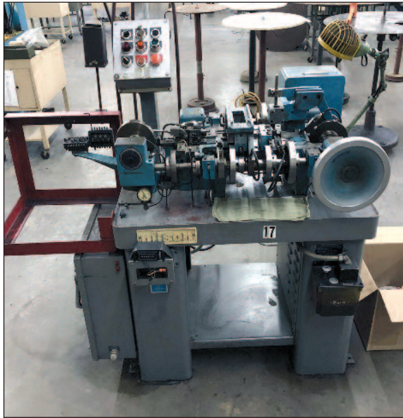
Nilson 700-L Wire Former