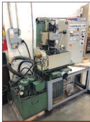
Charmilles D10 EDM