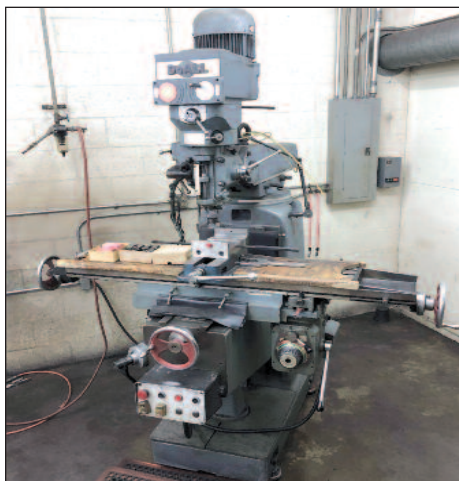
DoAll Vertical Mill