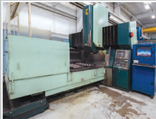
KURAKI KMV-130 Double Column CNC VBM