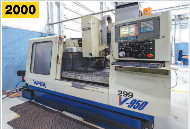
VIPER VMC950-G CNC Vertical Machining Center