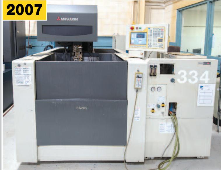
MITSUBISHI FA20S CNC Electrical Discharge Machine