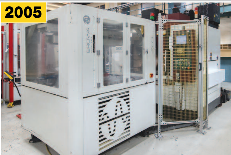
OKK VM5-III CNC Vertical Machining Center (Erowa Robot May Be Sold Separately)