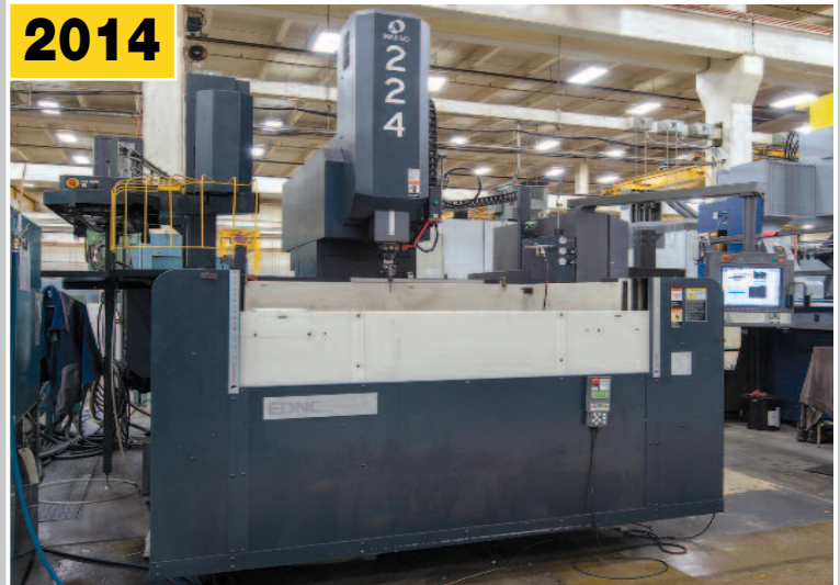
MAKINO EDNC85W RAM Type Electrical Discharge Machine