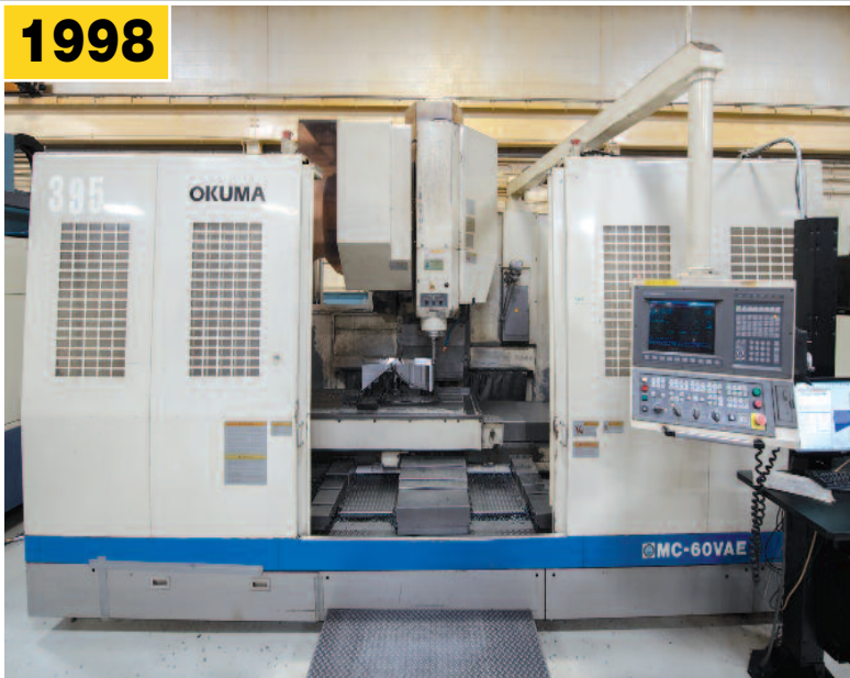
OKUMA MC60VAE 3-Axis CNC Vertical Machining Center