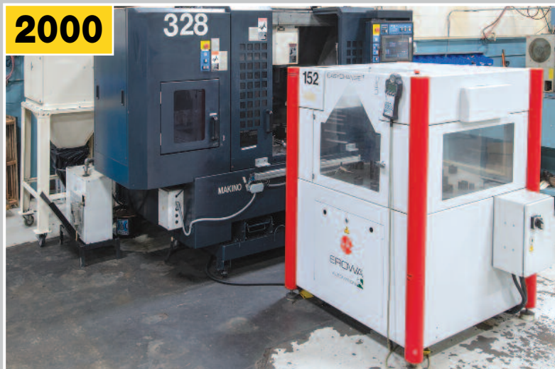
MAKINO V33 CNC Vertical Machining Center (Erowa Robot May Be Sold Separately)