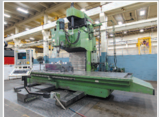
DROOP & REIN FSM1406D30KA CNC Vert. Mill