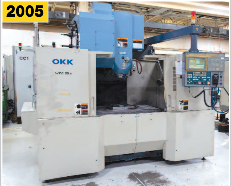
OKK VM5-II 3-Axis CNC Vertical Milling Machine