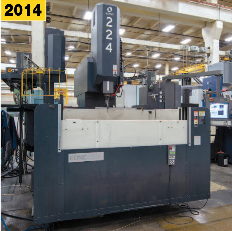
MAKINO EDNC85W RAM Type Electrical Discharge Machine