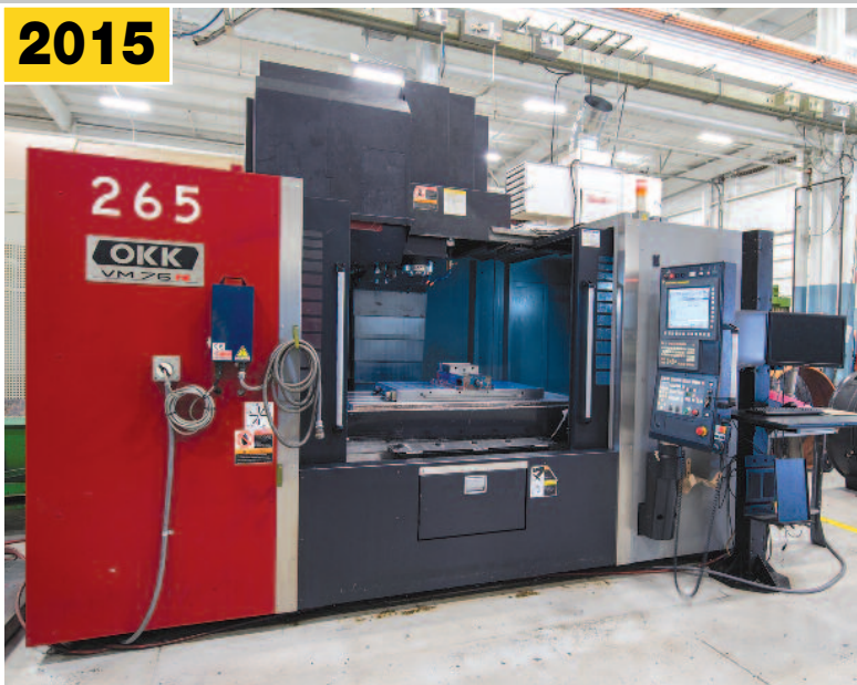
OKK VM76R CNC Vertical Machining Center