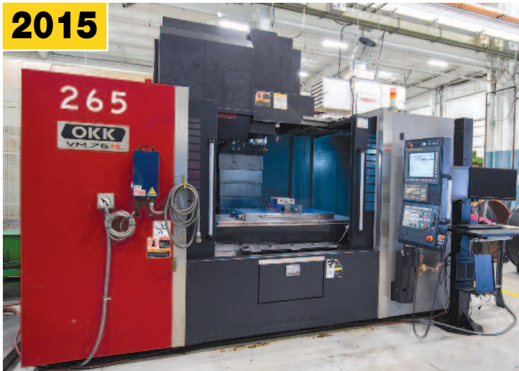
OKK VM76R CNC Vertical Machining Center