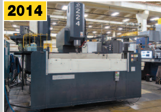
MAKINO EDNC85W RAM Type EDM

TERMS & CONDITIONS | PAYMENT: 25% Non-Refundable Deposit on Award of Bid, Balance in 24 Hours. Payment is Cash, Cashier's Check, Certified Check, Wire Transfer, Company Check Only if Accompanied by a Letter from your Bank Guaranteeing Amount of Check for Deposit and/or Payment in Full. No Personal Checks. Full Payment Must be Made Before Removal of Purchase. Everything is Sold "As-Is, Where-Is" All Sales Final. Cost and Responsibility for Removal of Purchase Remains the Purchaser. Every Effort will be Made to Facilitate Removal. While Quantities and Descriptions are Believed to be Accurate, the Auctioneer, Owners or Counsel Make no Warranties or Guarantees Either Expressed or Implied as to Authenticity, Genuineness of, or Defects in Any Lot and will not be Held Responsible for any Advertising Discrepancies or Inaccuracies. No Warranties Whatsoever are Made as to Condition Merchantability or Fitness for Use of Any Item. May we Suggest you Take Full Advantage of the Preview and Inspection Period. Sale Subject to Additions, Deletions and Prior Sales. Please Check Availability of Equipment.