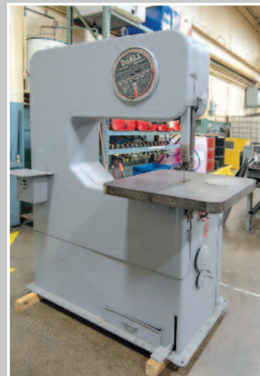
DOALL 30-M Vertical Bandsaw