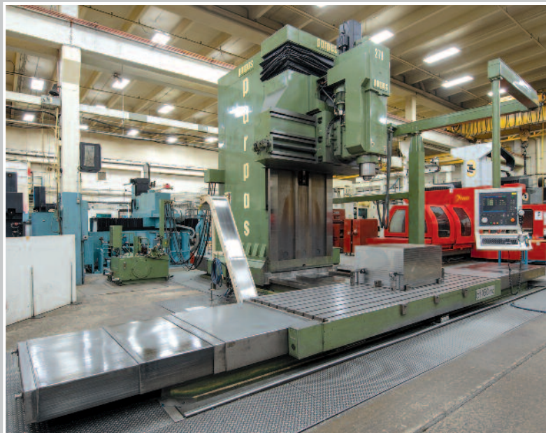
PARPAS BF-160-NC CNC Vertical Machining Center