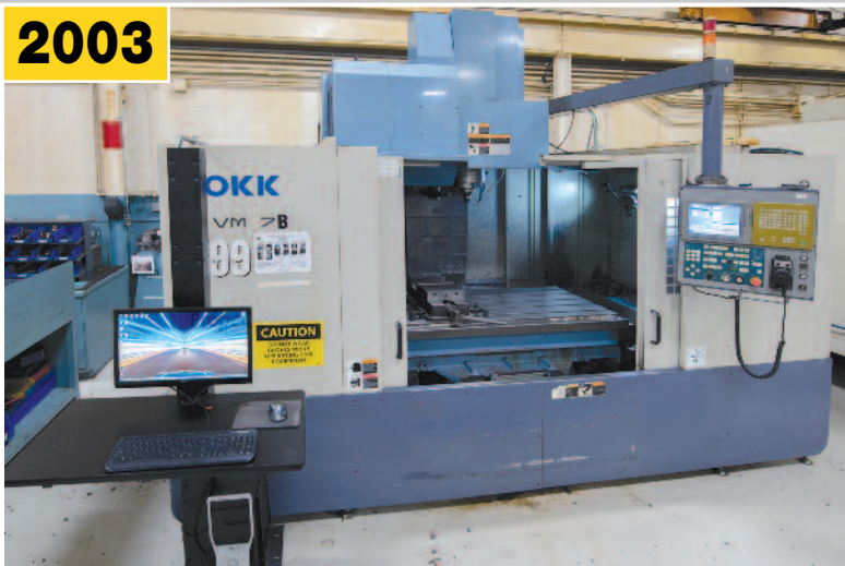
OKK VM-7 CNC Vertical Machining Center