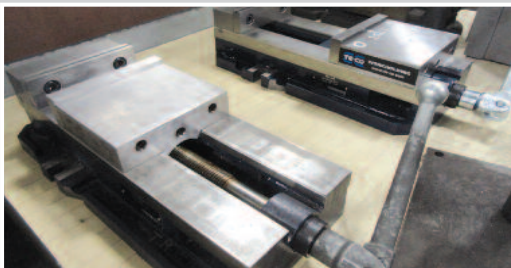
VIEW OF VICES