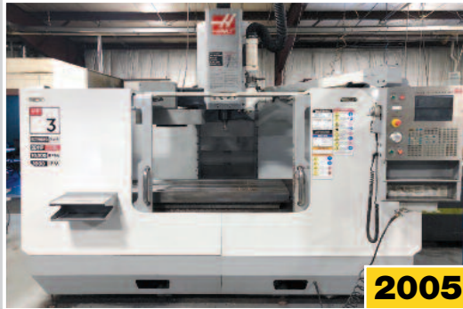
2005 HAAS VF-3D CNC Vertical Machining Center