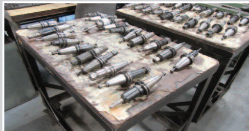
VIEW OF TOOL HOLDERS