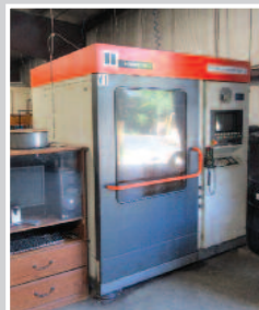
CHARMILLES Wire EDM