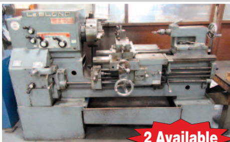
LEBLOND Engine Lathes