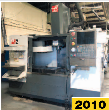
2010 HAAS VF-2 CNC VMC