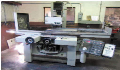
OKAMOTO 1632DX Surface Grinder

21700 Northwestern Hwy. Suite 1180 Southfield, MI 48075