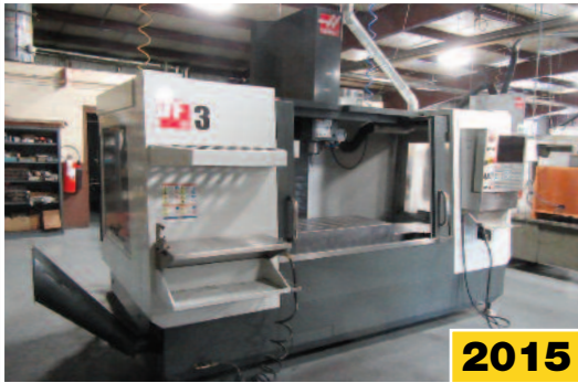
2015 HAAS VF-3 CNC Vertical Machining Center Grinder

Online Only | Live Webcast | No On-Site Bidding