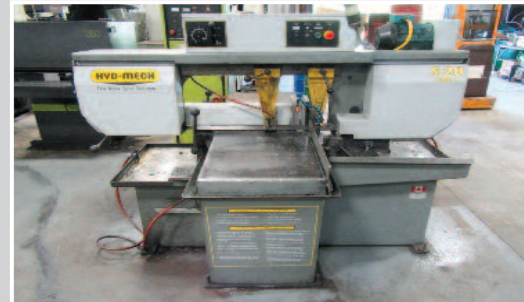
HYD-MECH S-20 Horizontal Band Saw