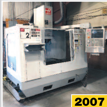
2007 HAAS VF-2B CNC VMC