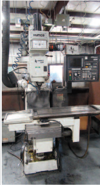
HURCO Hawk 5 CNC VMC

INSPECTION LOCATION: 6310 Grand Haven Road Norton Shores, MI