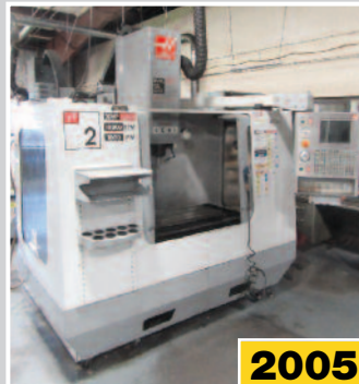
2005 HAAS VF-2B CNC VMC