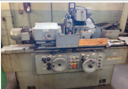
Cincinnati OD Grinder