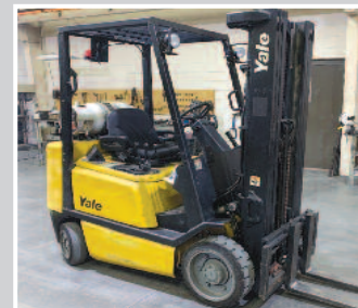
Yale 3,500 Lb. Cap. LP Forklift