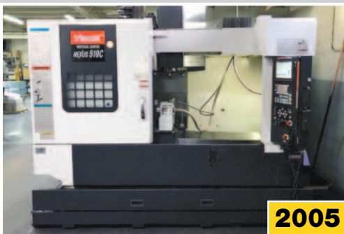
Mazak Nexus 510C CNC VMC, w/4th Axis Rotary