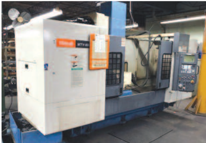
Mazak MTV-655-60M CNC VMC

ATTENTION: PLANT MANAGER OR EQUIPMENT BUYER