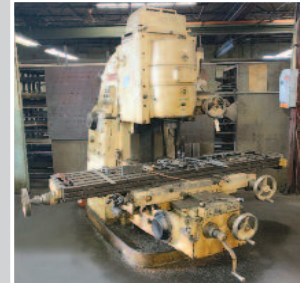
Cincinnati Vertical Mill