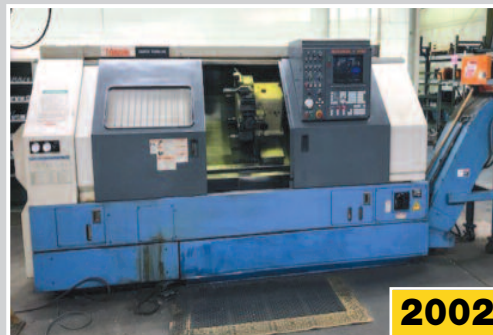
Mazak Quick Turn 40 CNC Turning Center