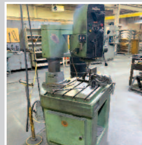
Doall Drill Press