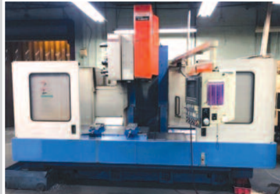
Mazak V-655-60 CNC VMC