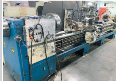
Toolmex TUR-630A 24' x 151' Lathe