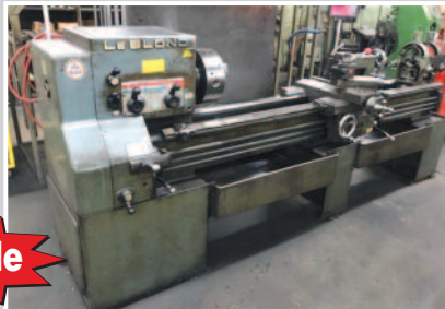
Leblond Regal Lathes