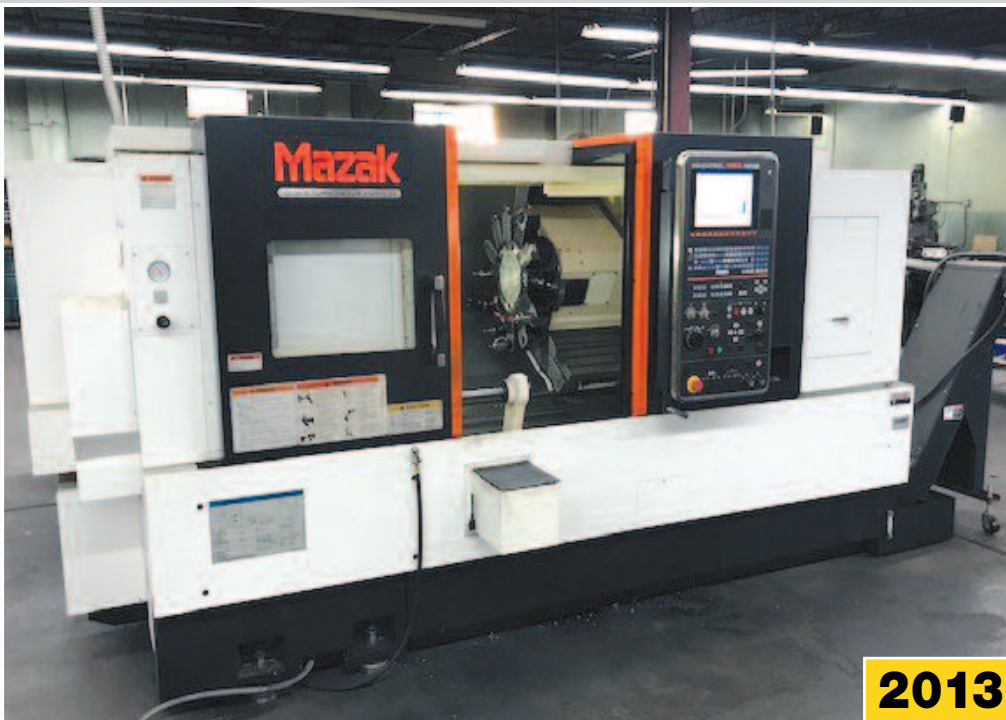
Mazak Quick Turn Nexus 250M CNC Turning Center

PREVIEW & INSPECTION: Tuesday, February 4th, 9am to 4pm or By Appointment PREVIEW LOCATION: 2040 Bennett Road, Philadelphia, PA 19116