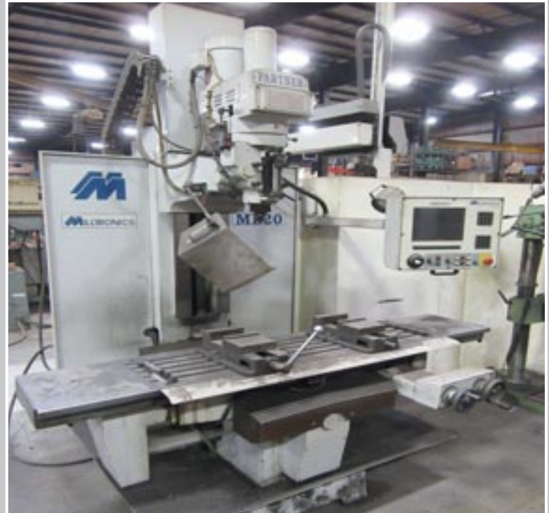
MILLTRONICS MB20 CNC Vertical Milling Machine