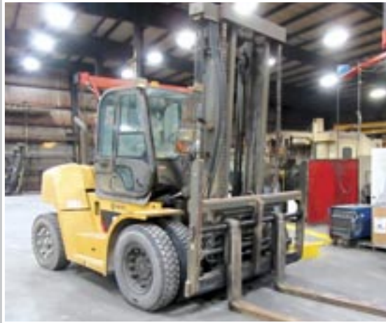
CAT P2200 Forklift