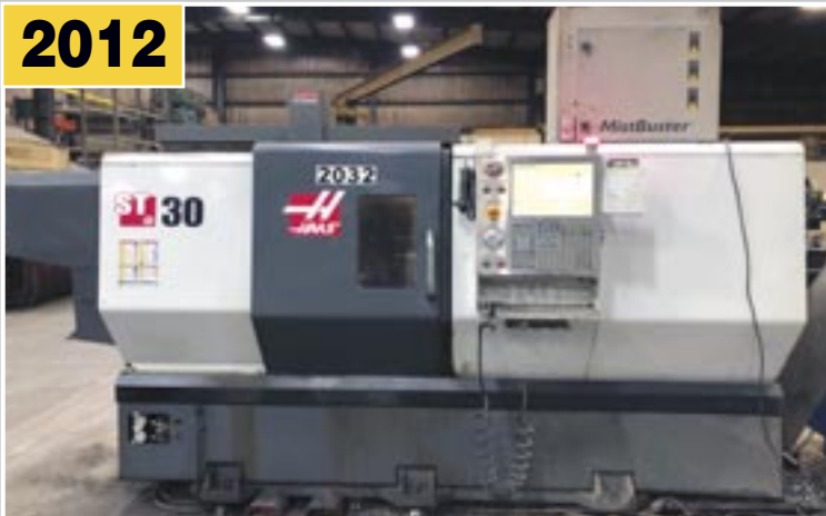
HAAS ST30 CNC Lathe