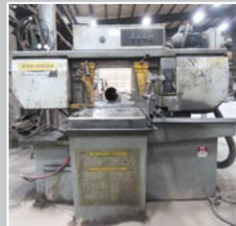
HYD-MECH S20 Horizontal Band Saw