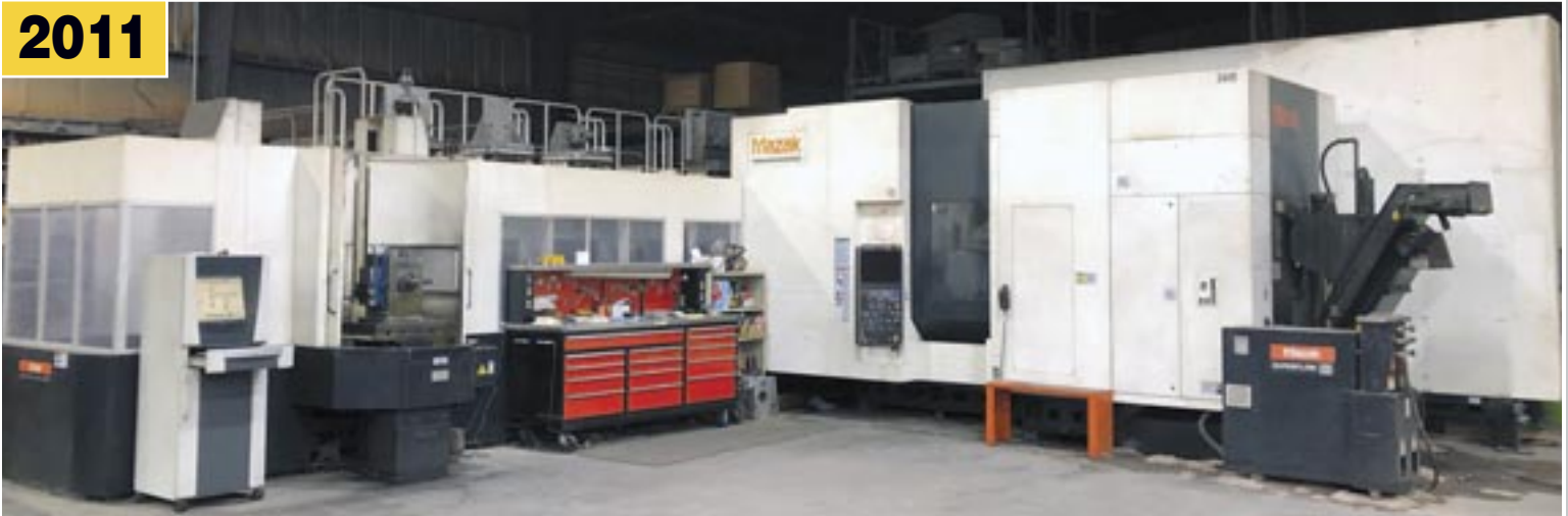
MAZAK Nexus 6800-II CNC Horizontal Machining Center