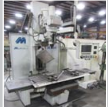
MILLTRONICS MB20 CNC VMC

TERMS & CONDITIONS | PAYMENT: Full payment within 24 hours. Payment is Cash, Cashier's check, Certified Check, or Wire Transfer. No other forms of payments will be accepted. Full Payment Must be Made before removal of Purchase. Everything is Sold "As-Is, Where-Is". All Sales Final. Cost and Responsibility for Removal of Purchase Remains with the Purchaser. Every Effort will be Made to Facilitate Removal. While Quantities and Descriptions are Believed to be Accurate, the Auctioneer, Owners or Counsel Make no Warranties or Guarantees Either Expressed or Implied as to Authenticity, Genuineness of, or Defects in Any Lot and will not be Held Responsible for any Advertising Discrepancies or Inaccuracies. No Warranties Whatsoever are Made as to Condition Merchantability or Fitness for Use of Any Item. May we Suggest you Take Full Advantage of the Preview and Inspection Period. Sale Subject to Additions, Deletions and Prior Sales. Please Check Availability of Equipment.