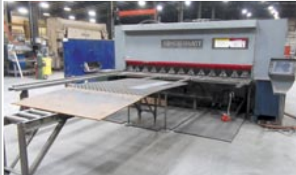
CINCINNATI 375HS Shear