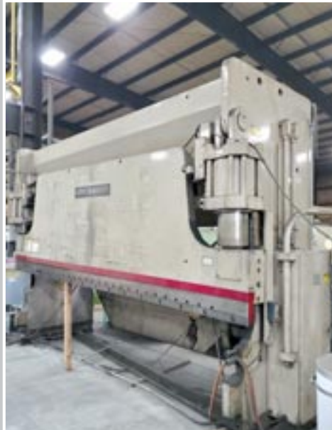
CINCINNATI 350FMII CNC Press Brake