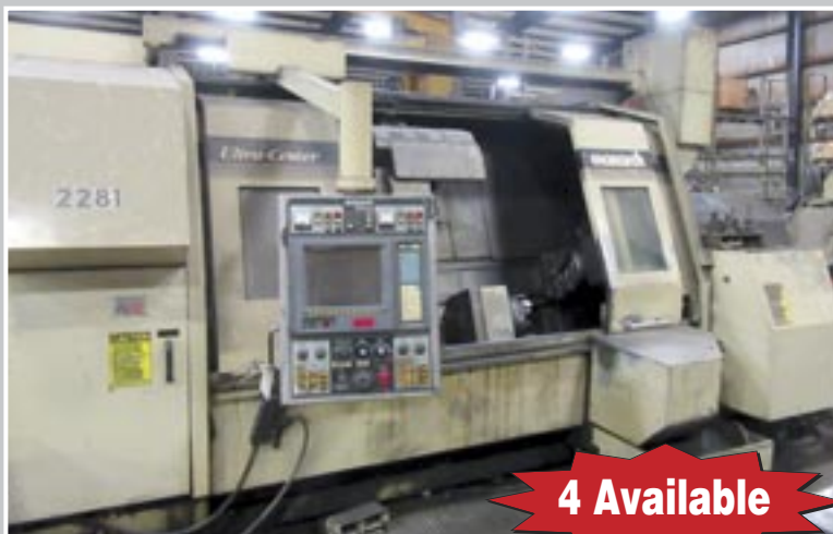
MONARCH Ultra Center CNC Lathe