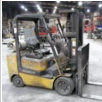
CAT GC30 Forklift