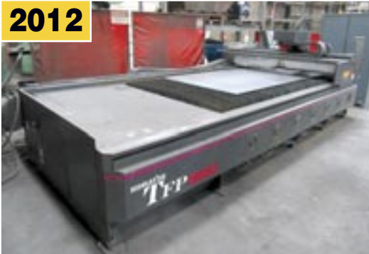
KOMATSU TFP 3026 CNC Plasma Cutter