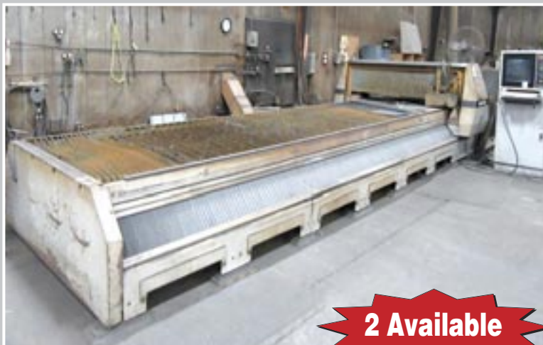
KOMATSU RASOR CNC Plasma Cutter