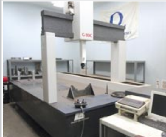
LK G-80C Coordinate Measuring Machine