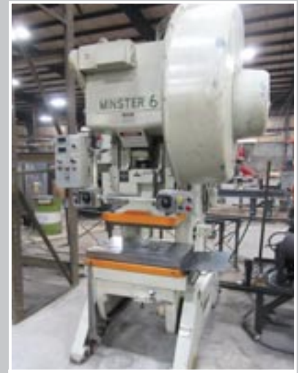
MINSTER 6 OBI Flywheel Press