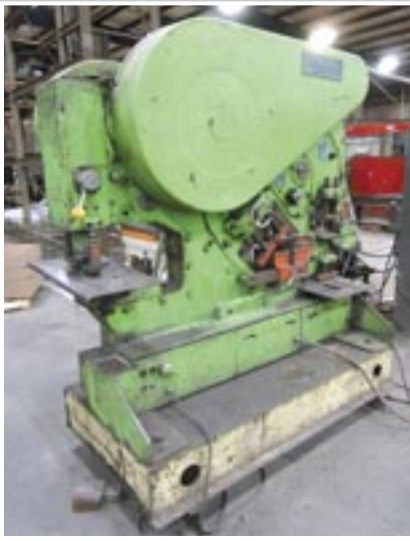
MUBEA KBL-104-7 Ironworker