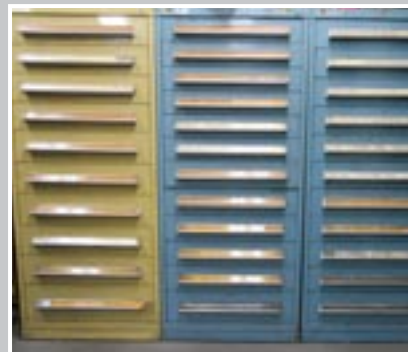
VIDMAR Cabinets with Contents