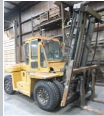
CAT DP-100 Forklift