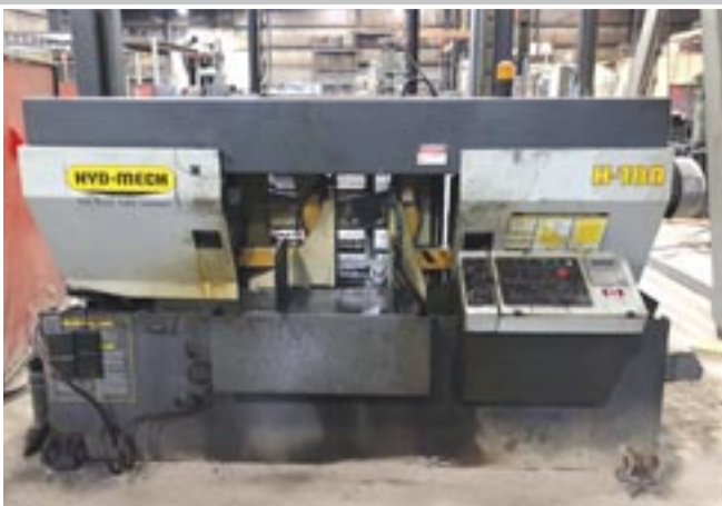
HYD-MECH H-18A Horizontal Band Saw