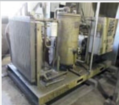
CURTIS Rotary Screw Air Compressor