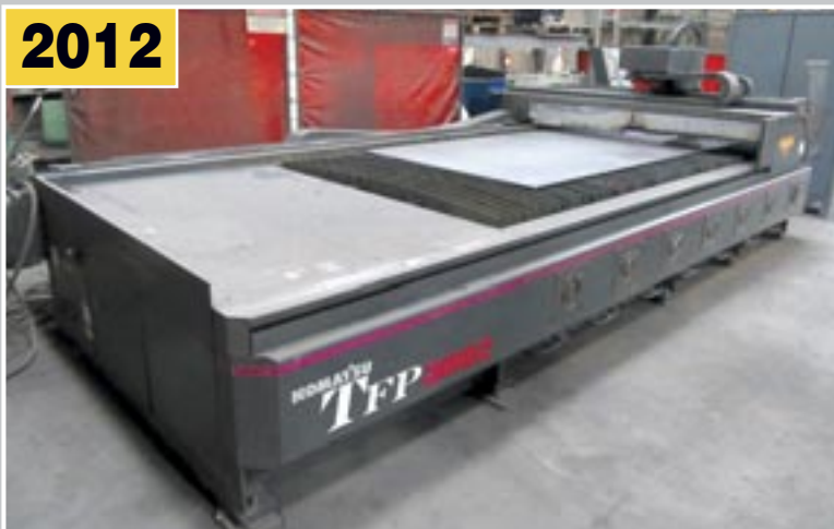
KOMATSU TFP 3026 CNC Plasma Cutter