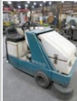
TENNANT Floor Scrubber