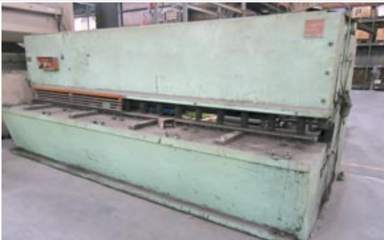
SUMMIT 12-1/2 Shear