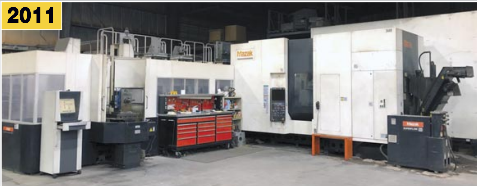
MAZAK Nexus 6800-II CNC Horizontal Machining Center