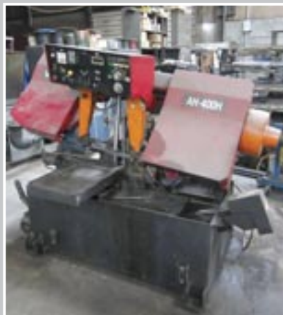
VICTOR AH-400H Horizontal Band Saw