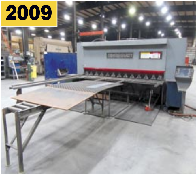
CINCINNATI 375HS Shear