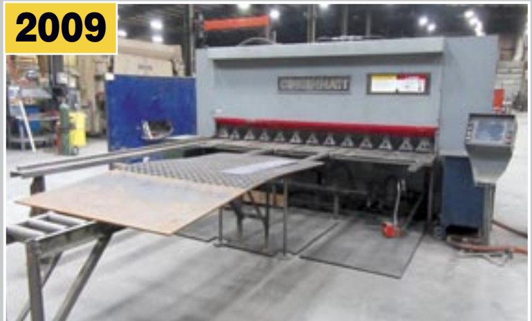
CINCINNATI 375HS Shear