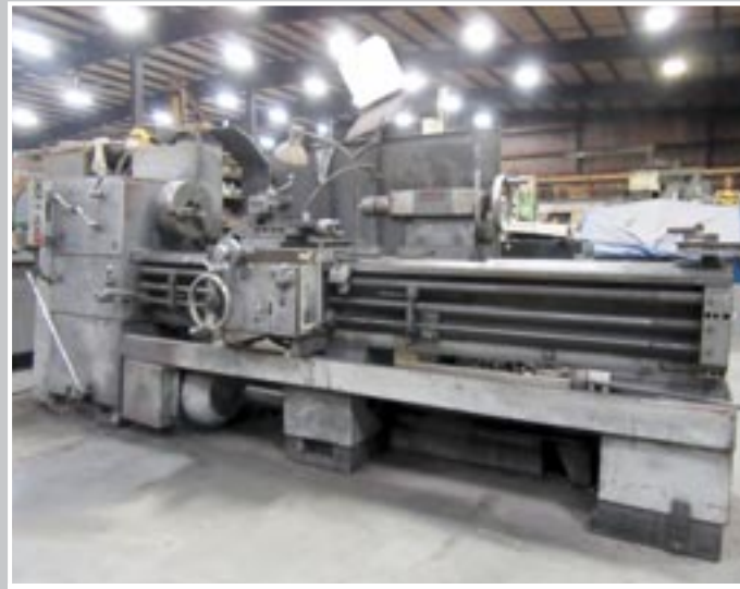
POLISH AMERICAN Engine Lathe