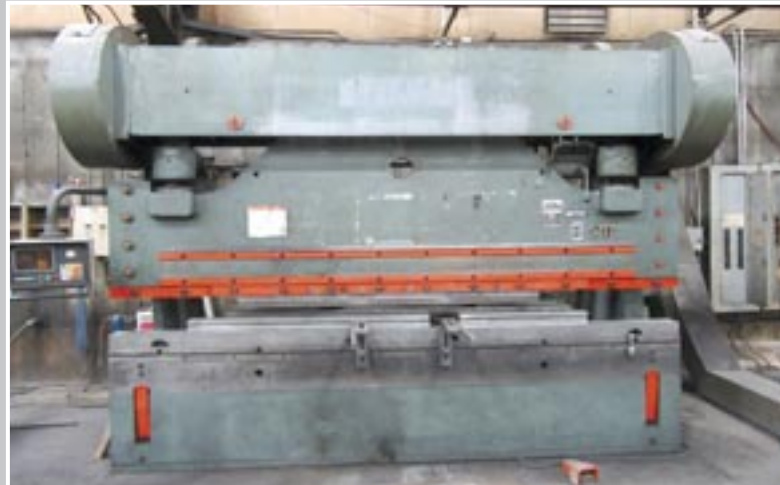
LODGE & SHIPLEY 120A10 Press Brake