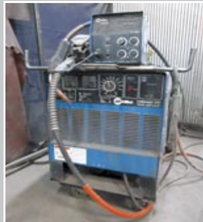
MILLER Deltaweld 451 Welding Power Source