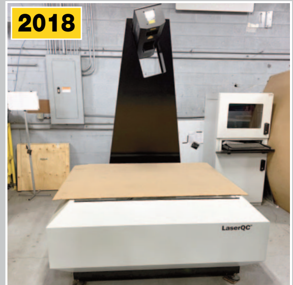
VIRTEK QC-1200 Laser Inspection Machine

FOR FURTHER INFORMATION CONTACT: Mario Mazzuca at (517) 204-0033 or mario@maynards.com