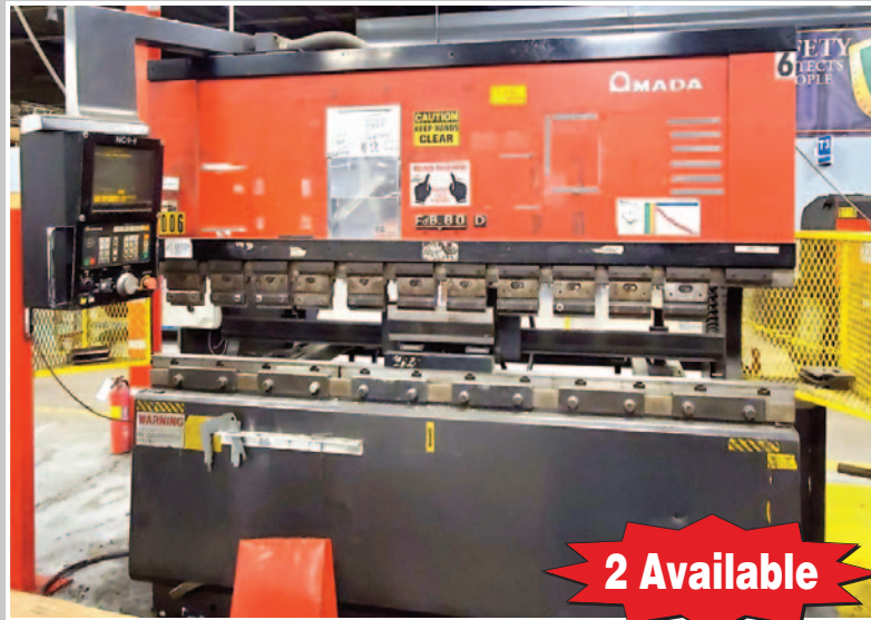
AMADA FBD-8025 CNC Press Brake