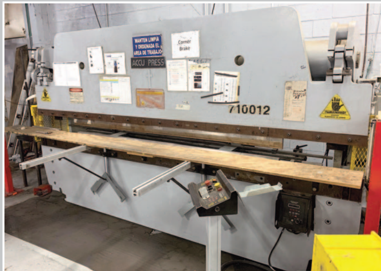
ACCURPRESS 100-Ton x 12' Press Brake