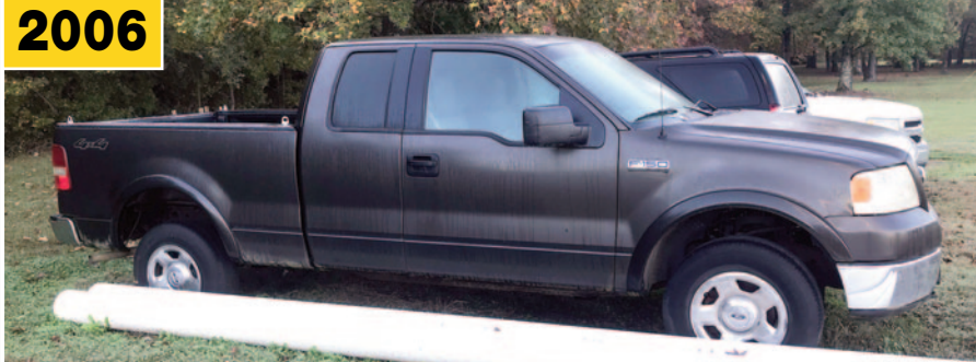
FORD F150 Pickup Truck, Super Cab