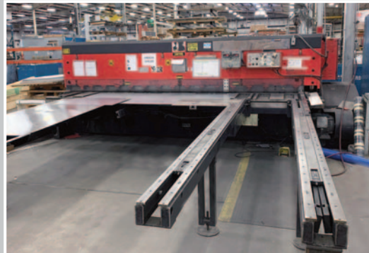
AMADA CNC Shear, 12 ga./14 ga. X 14'