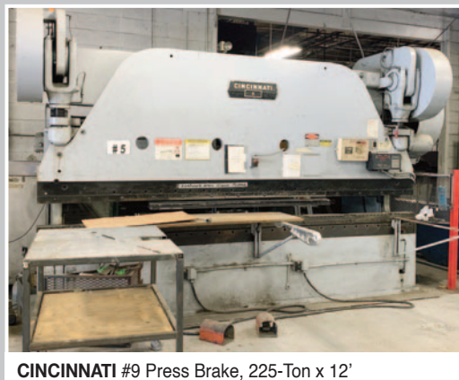
CINCINNATI #9 Press Brake, 225-Ton x 12'