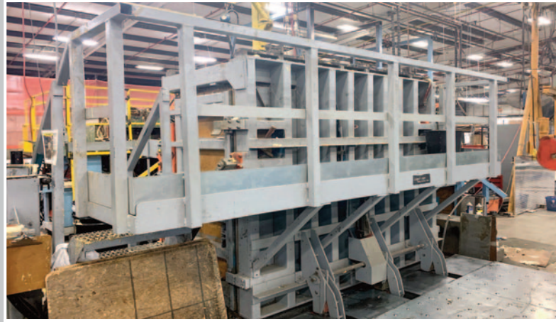
CON-TEK Foam Cavity Press, 30" x 84" Cap.