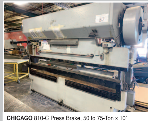
CHICAGO 810-C Press Brake, 50 to 75-Ton x 10'