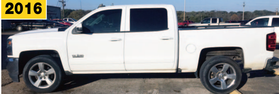
CHEVROLET Silverado Pickup Truck, Texas Edition