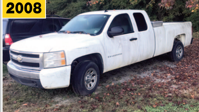
CHEVROLET Silverado 1500 Pickup Truck, Extended Cab