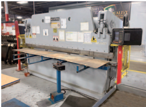
ACCURPRESS 175-Ton x 12' Press Brake

21700 Northwestern Hwy. Suite 1180 Southfield, MI 48075