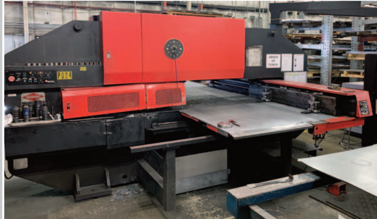
AMADA 30-Ton CNC Turret Punch