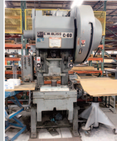
BLISS 60-Ton OBI Press