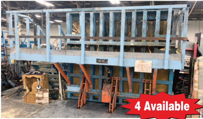
CON-TEK Foam Cavity Press, 27.5" x 84.5" Cap.