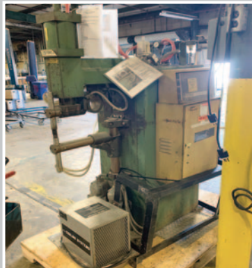
BANNER 75KVA Spot Welder