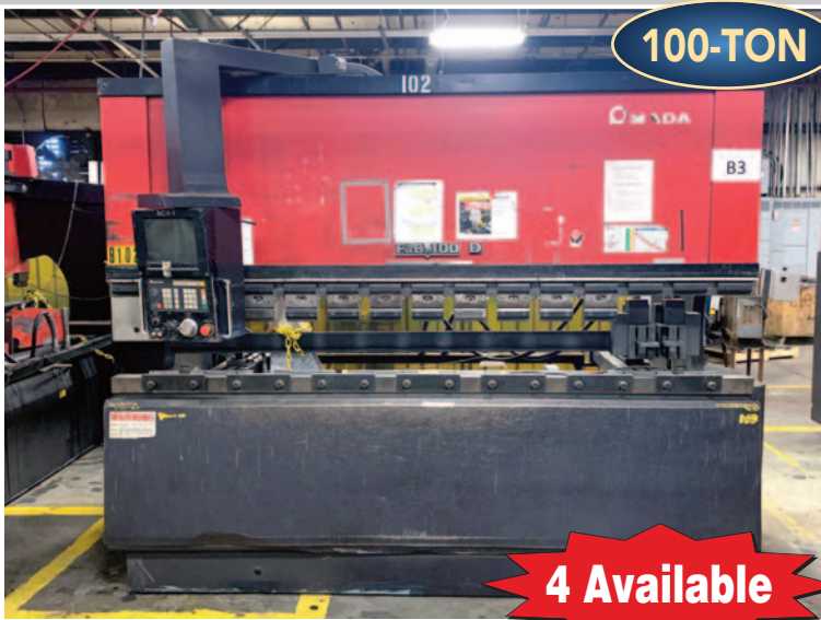
AMADA FBD-1030 CNC Press Brake

FEATURING: CNC Press Brakes • CNC Shear • Inspection • CNC Turret Punch • Cut-to-Length Lines OBI Press • Cavity Foam Presses – Mold Equipment • Vehicles • General Equipment/Welders