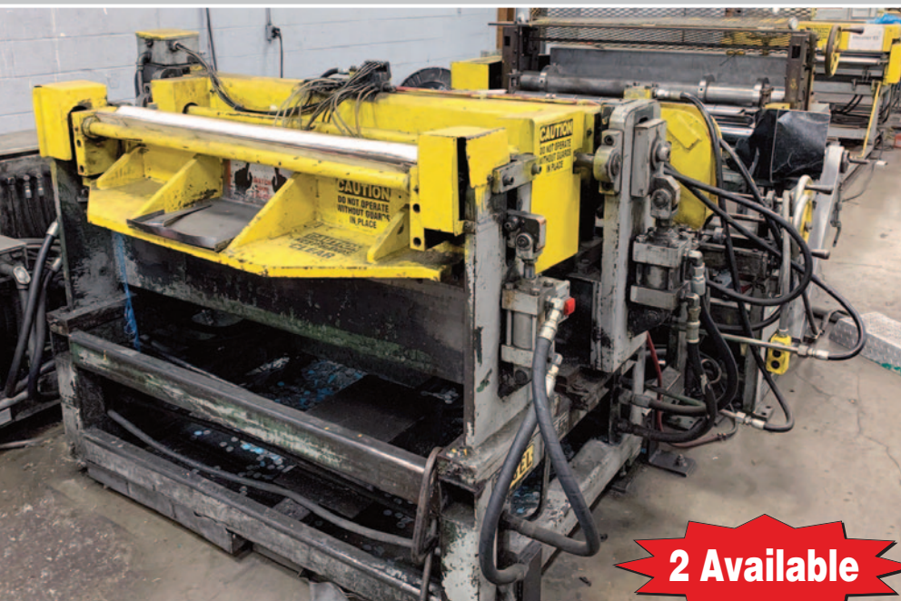
ENGEL Cut-to-Length Line