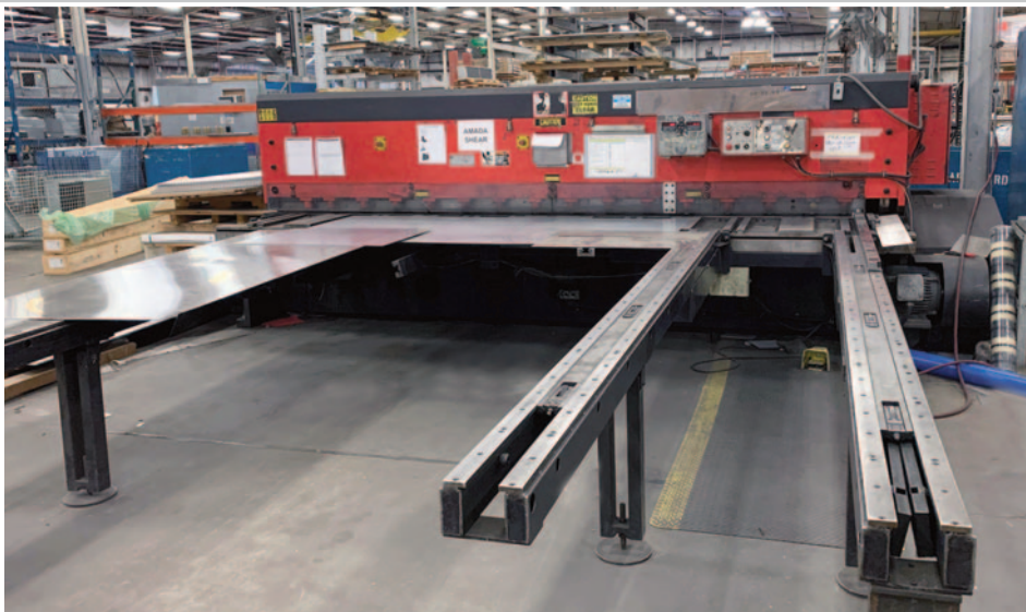
AMADA CNC Shear, 12 ga./14 ga. X 14'

908 State Highway 15 N, New Albany, MS 38652