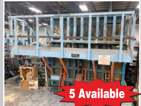
CON-TEK Foam Cavity Press