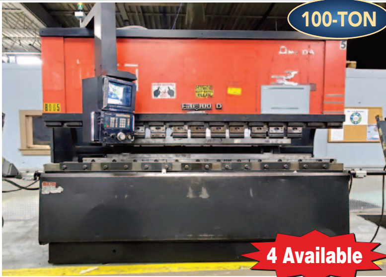
AMADA FBD-1030 CNC Press Brake