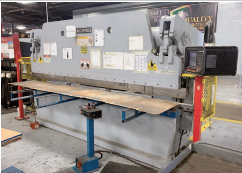
ACCURPRESS 175-Ton x 12' Press Brake