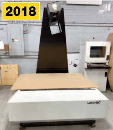
VIRTEK QC-1200 Laser Inspection Machine