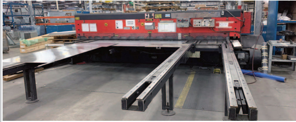
AMADA CNC Shear, 12 ga./14 ga. X 14'