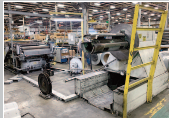
WELTY WAY Cut-to-Length Line