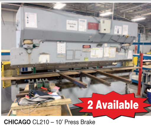
CHICAGO CL210 - 10' Press Brake