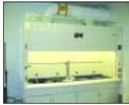
KEWAUNEE ACID BENCH