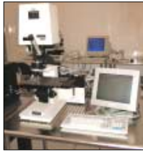
NANOMETRICS FILM THICKNESS MEASUREMENT SYSTEM, MDL AFT 210