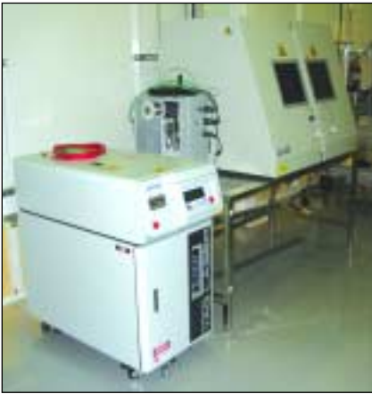
UNITEK MIYACHI LW100 COMPACT YAG LASER WELDING SYSTEM