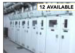
K.C. TECH GAS CABINETS