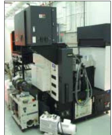
APPLIED MATERIALS P5000 DEPOSITION & ETCH