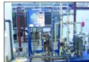
US FILTER DI WATER SYSTEM