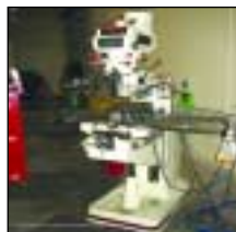
JET VERTICAL MILL