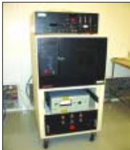
BRANSON/IPC BARREL ASHER