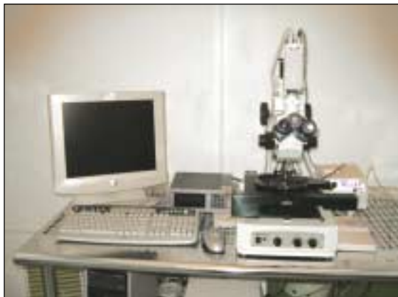
LABTEK MOTORIZED STAGE MICROSCOPE