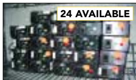
WAVE OPTICS LASER SOURCE