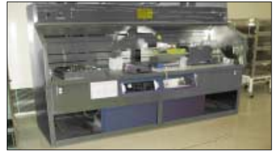
CEE PHOTO RESIST SPIN COAT BENCH WITH KARL SUSS RCB SPIN COATER.