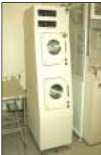
RHETECH SEMITOOL DUAL STACK SPIN RINSE DRYER