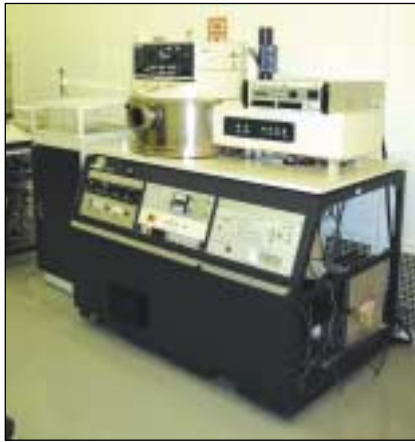
PERKIN ELMER SPUTTERING SYSTEM