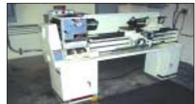
ENVIROTRONICS TEST CHAMBER