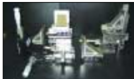
NEWPORT 562 XYZ TRANSLATION STAGES / LINEAR STAGES