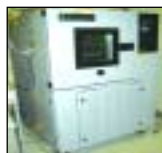
ENVIROTRONICS TEST CHAMBER