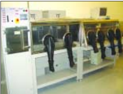
SSEC PARALLEL SEAM SEALER, MDL. 2300