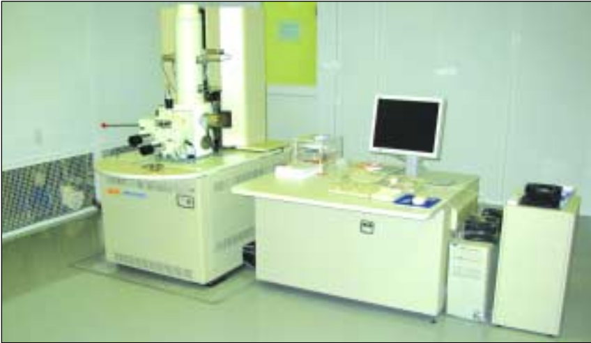
JEOL FIELD EMISSION SCANNING ELECTRON MICROSCOPE, MDL. JSM-6335F