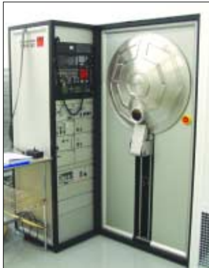
CHA INDUSTRIES VAPOR DEPOSITION SYSTEM