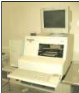
KLA TENCOR THIN FILM STRESS MEASUREMENT SYSTEM