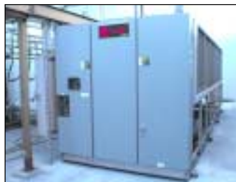
TRANE SERIES R 215-TON CHILLER