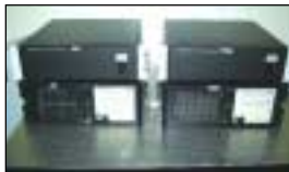
NEWPORT PM-500-C PRECISION MOTION CONTROLLERS