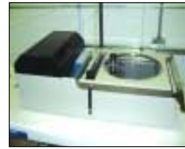
KLA TENCOR SURFACE PROFILOMETER