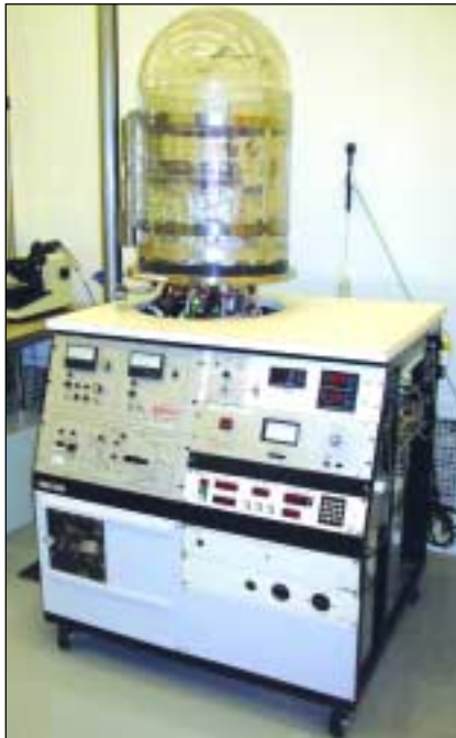
VEECO THERMAL EVAPORATOR