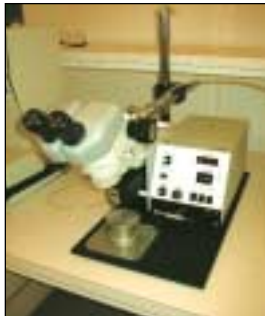
UNITEK MICROPULL IV PULL TESTER, MDL. 6-099-05