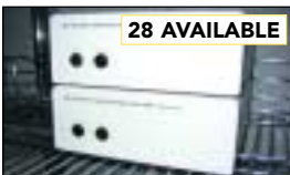
NEWPORT 4832C MULTI CHANNEL OPTICAL POWER METER