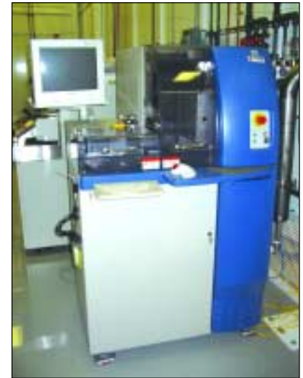
KULICKE & SOFFA AUTOMATIC DICING SAW