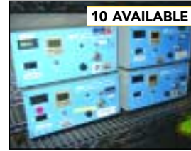
EFOS ULTRACURE 10055