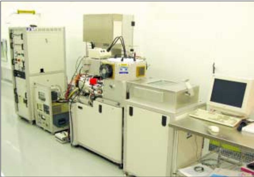
STS MULTIPLEX ICP