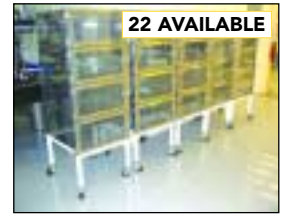
TERRA DESICCATOR CABINET SYSTEMS