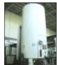
PRAXAIR LIQUID NITROGEN TANK