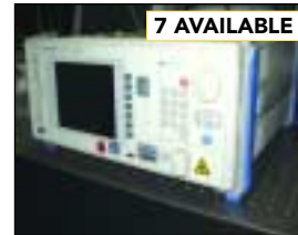
ANDO AQ 4321D