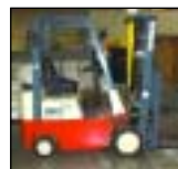
NISSAN FORK LIFT