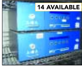
EFOS NOVA CURE