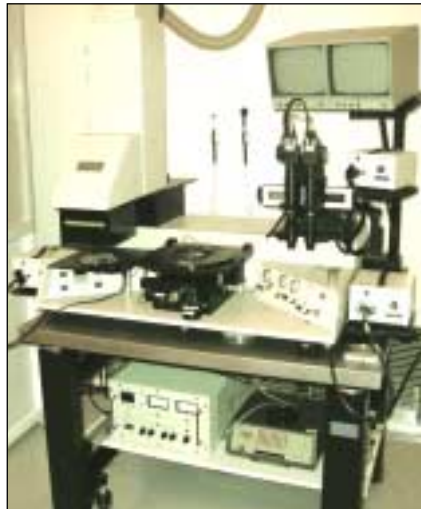
AB-M MASK ALIGNER