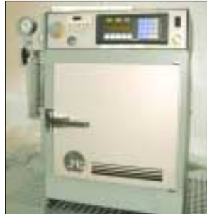
YES HMDS OVEN, MDL. 310D