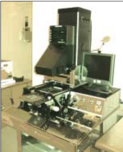
EVG MASK ALIGNER