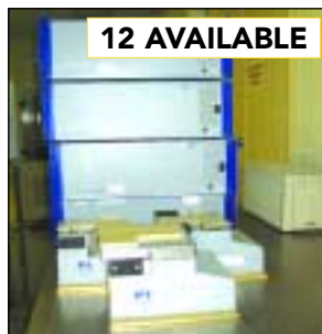
PHYSIK INSTRUMENTE HEXAPOD