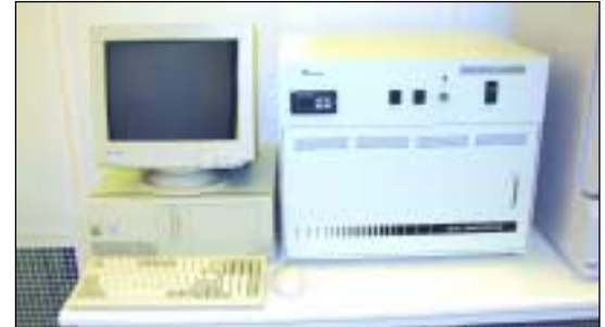
KLA TENCOR SURFACE PROFILOMETER, MDL. P11