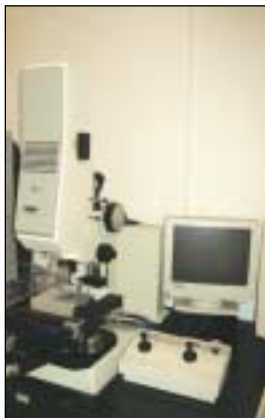
ZYGO NEW VIEW 100 INTERFEROMETER