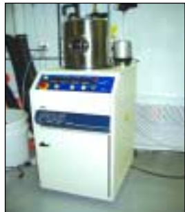
SCS PARYLENE COATING SYSTEM, MDL. PDS 2010