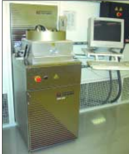
PLASMA-THERM 790 SERIES DEPOSITION & ETCH