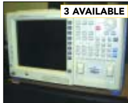
ANDO AQ 6317B