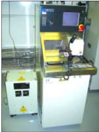
DISCO AUTOMATIC DICING SAW