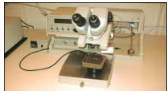
WESTBOND WEDGE/BALL BONDER, MDL. 7600E