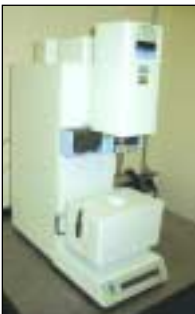
PERKIN ELMER DYNAMIC MECHANICAL ANALYZER