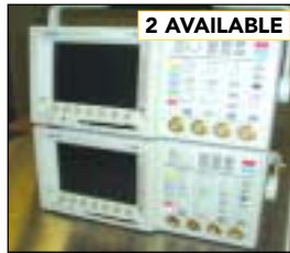
TEKTRONIX TDS 3014AB