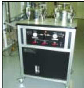
VACUUM INSTRUMENT CORPORATION DUAL HELIUM BOMB