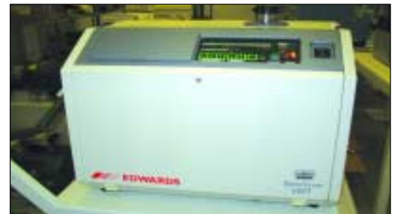
EDWARDS SPECTRON LEAK DETECTOR, MDL. 600T