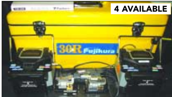
FUJIKURA FSM-30R FUSION SPLICER