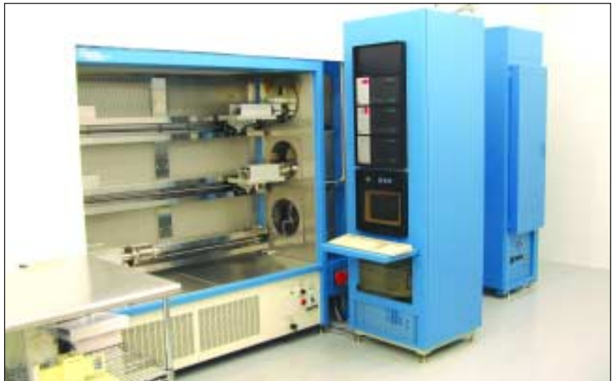
EXPERTECH TUBE FURNACE, MDL. LSTA