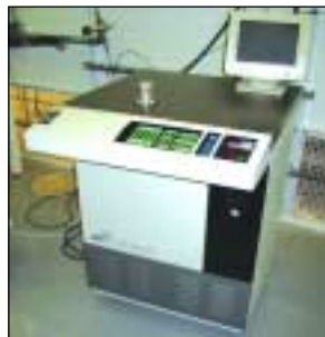
VEECO LEAK DETECTOR, MDL. MS 50