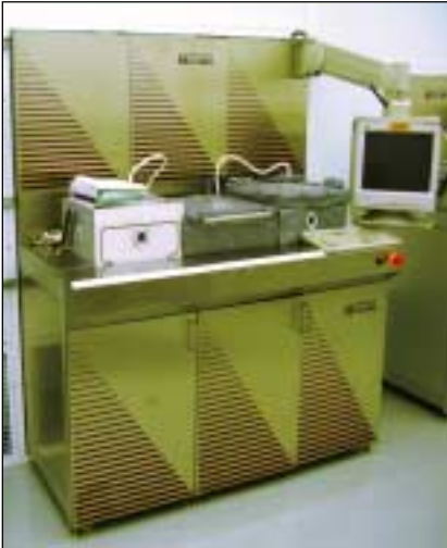
PLASMA THERM SLR SERIES RIE SYSTEM