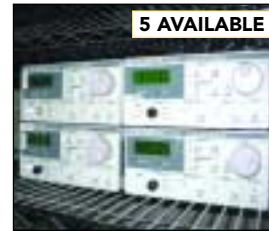
ILX LIGHTWAVE LDT-5525