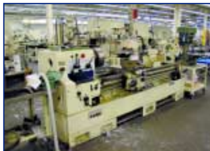
SHIESHING 24" X 80" ENGINE LATHE