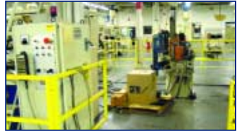
CINCINNATI TYPE T3 ROBOT, MDL. 360