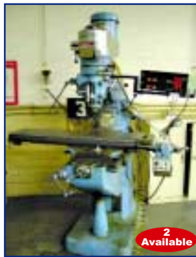
BRIDGEPORT SERIES 1 2 HP VARIABLE SPEED VERTICAL MILLING MACHINES