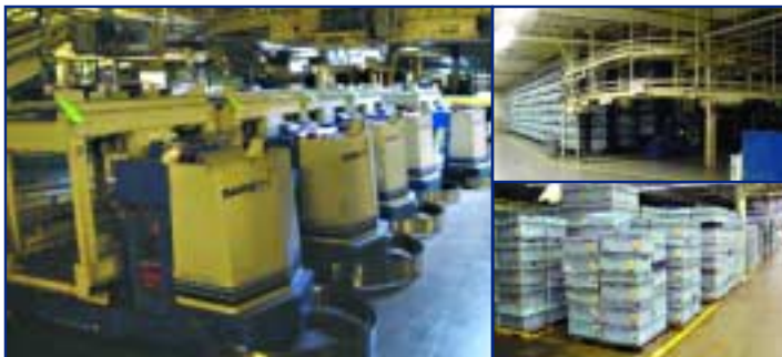
VIEW OF COMPLETE PARTS STORAGE & RETRIEVAL SYSTEM