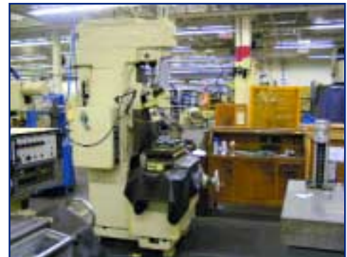
Moore Jig Borer Mdl. #3