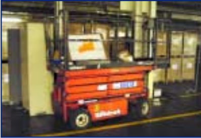
ECONOMY ELECTRIC SCISSOR TYPE MANLIFT, MDL. SPL-2142