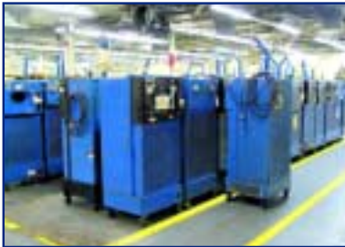
VIEW OF REGENERATIVE AIR DRYERS