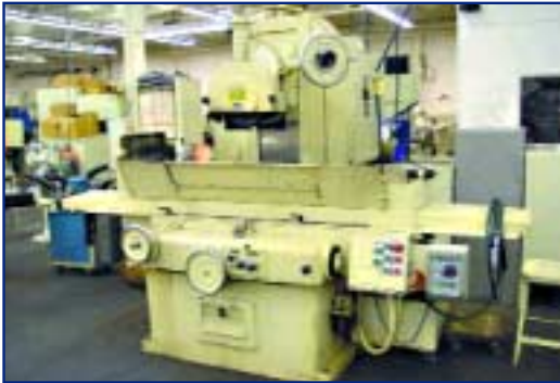
2" X 36" GRAND RAPIDS G&L SURFACE GRINDER, MDL. 550