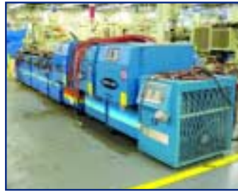
VIEW OF CHILLERS