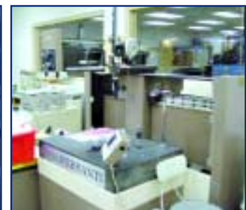
26" X 37" FERRANTI CMM

To Schedule an Auction, Call: 818.508.7034