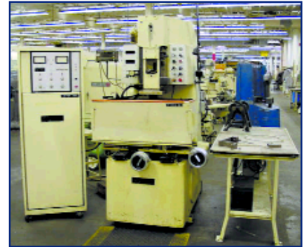
ELOX ELECTRIC DISCHARGE MACHINE, MDL. 8-2012-DR