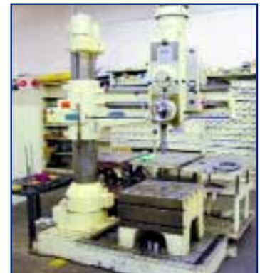
K&W TYPE 4'0" E31 RADIAL DRILL