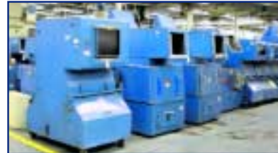
VIEW OF GRANULATORS