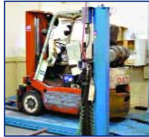
12,000 LB. ROTARY HYDRAULIC FORK LIFT SERVICE LIFT, MDL. FLS-12