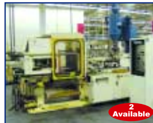
ENGEL PLASTIC INJECTION MOLDING MACHINES, MDL. ES700-300