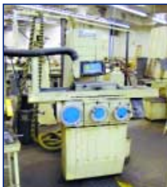
6" X 18" BROWN & SHARPE MICROMASTER SURFACE GRINDER, MDL. 618