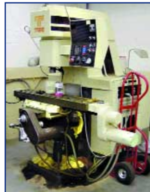
TREE JOURNEYMAN CNC VERTICAL MILLING MACHINE, MDL. J300