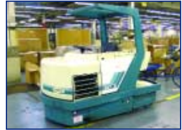
TENANT L/P OPERATED FLOOR SCRUBBER, MDL. 527