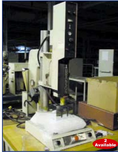
BRANSON SONIC WELDERS, MDL. 5170