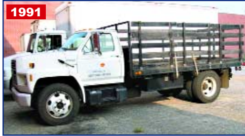
1991 FORD 15' STAKE TYPE TRUCK, MDL. F-600