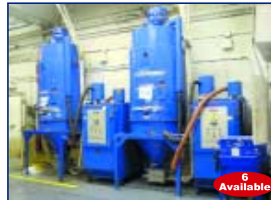
CONAIR MATERIALS HOPPERS W/RECEIVERS MDL. D403301 & CONAIR MATERIALS PREHEAT DRYERS