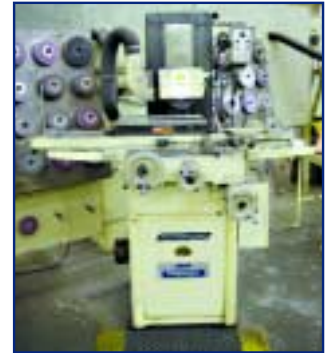
6" X 18" REID SURFACE GRINDER, MDL. HR