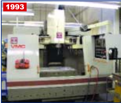
TREE VERTICAL MACHINING CENTER, MDL. VMC 1050 /40