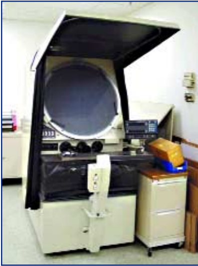
30" SCHERR OPTICAL COMPARATOR