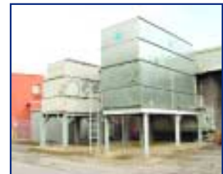
COMPLETE WATER SYSTEM FOR PLASTIC INJECTION MOLDING MACHINES