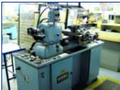
HARDINGE DOVETAIL PRECISION LATHE, MDL. HC