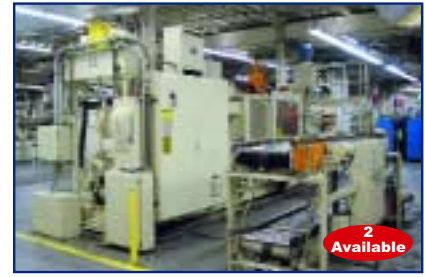
REBUILT 1992 BY CINCINNATI VAN DORN, MDL. 500 TON 60 OZ PLASTIC INJECTION MOLDING MACHINES