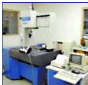
32" X 42-1/2" FERRANTI METROLOGY MERLIN CMM