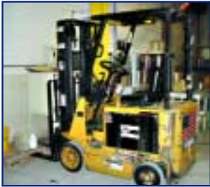
3000 LB. CATERPILLAR ELECTRIC FORK LIFT TRUCK, MDL. EC-15