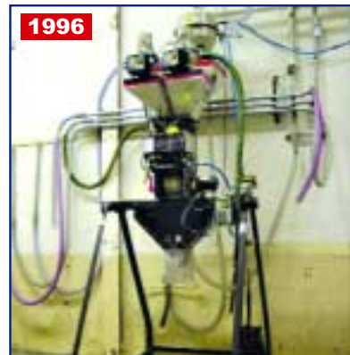
VIEW OF MCGUIRE PRODUCTS MATERIAL COLORANT MIXER MDL. WSB440R