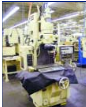
MOORE JIG GRINDER MDL. G18