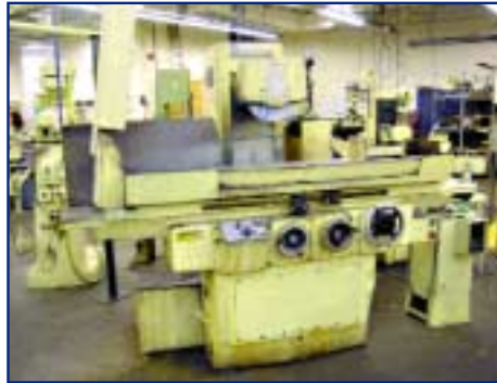
12" X 36" BROWN & SHARPE MICROMASTER SURFACE GRINDER, MDL. 1236