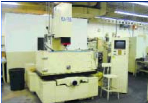
ELOX ELECTRIC DISCHARGE MACHINE MDL. AMERITRON 200 MS