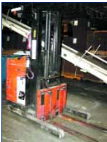
4000 LB. RAYMOND NARROW AISLE ELECTRIC FORK LIFT TRUCK, MDL. 20-R40TT

To Include Muffle Ovens, Hansford 4 Post Hydraulic Die Press, Hand Blast Cabinet, Die Filers, (2) WESTHOF Electrode Drills, Sonic Polisher, Deckel Grinder, Bench Lapper, Height Gauges, Vidmar Cabinets, Tooling, Hand & Power Tools, HAMMOND Buffer, ROCKWELL Belt Grinders, 3 Wheel Bicycles, RAMJET Trash Compactor, Propane Filling System & Tanks, Steam Cleaner, Snow Plow, Salt Spreader, Weed Eaters, (2) Lawn Mowers, Pumps, Snow Blower, WABASH Mold Press, Dust Collectors, Tracer Mill, Sonic Welders, Rivet Machines, Glue Guns, Motors, Cable, Tables, Vises, Pallet Jacks, Roller Conveyor, Automatic Assembly Lines, (2) Genie Superlifts, MARATHON Paper Baler, Scales & Much More!