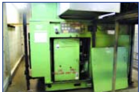
SULLAIR 150 HP SCREW TYPE AIR COMPRESSOR, MDL. 20-150L