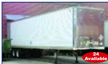
40' & 45' SINGLE & DUAL AXLE VAN TRAILERS.