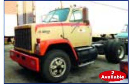
GMC BRIGADIER SINGLE AXLE DUAL TIRE DIESEL TRACTORS