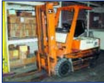
6000 LB. TOYOTA ELECTRIC FORK LIFT TRUCK, MDL. 2FBCA30