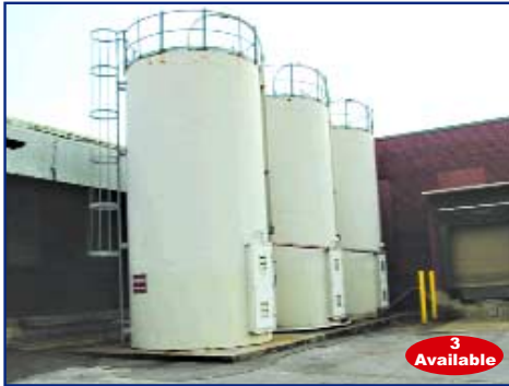
VIEW OF STORAGE SILOS