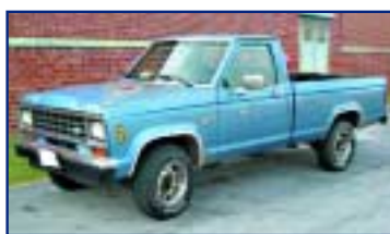
FORD PICKUP TRUCK, MDL. F250