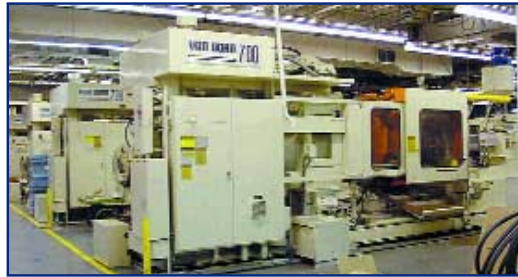
VIEW OF REBUILT 1993 BY CINCINNATI VAN DORN, MDL. 700 PLASTIC INJECTION MOLDING MACHINES