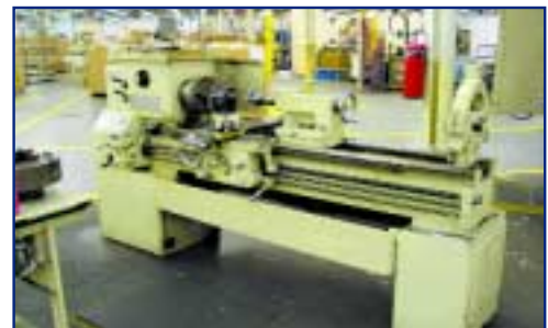
LEBLOND REGAL 18" X 66" GEAR HEAD LATHE