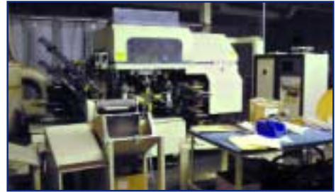
BOUCHERIE CNC DRILL & INSERT FLOOR BRUSH ASSEMBLY MACHINE, MDL. TM-2R