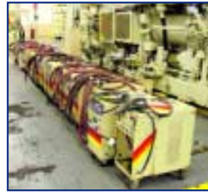
VIEW OF WATER HEATERS