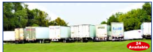
VIEW OF 40' & 45' SINGLE & DUAL AXLE VAN TRAILERS.

To View Complete Asset List, Visit our Website: www.biditup.com