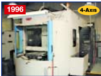
TOYODA (4) AXIS VMC, MDL. FA 550