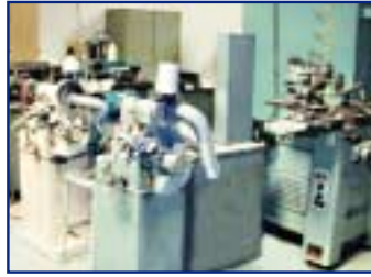
TOOL & CUTTER GRINDER, MDL. 1704