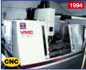
TREE VERTICAL CNC MACHINING CENTER, MDL VMC 1050/24

THE ITEMS LISTED BELOW ARE LOCATED OFF SITE AND WILL BE SOLD VIA PHOTO & BIDCAST FROM THE AUCTION LOCATION. FOR ADDITIONAL INFORMATION, PLEASE CALL 818.508.7034