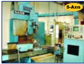
BOSTOMATIC 1000 (5) AXIS VMC, MDL. 517-1