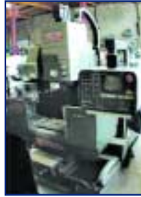
SHARNOA VERTICAL MACHINING CENTER, MDL. SDC-20