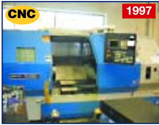
IKEGAI CNC LATHE, MDL. TU30L