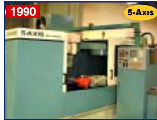
BOSTOMATIC (5) AXIS VMC, MDL. 505-40TC