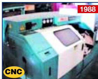
MAZAK CNC TURNING CENTER, MDL. QUICKTURN 15