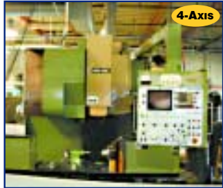
MORI SEIKI (4) AXIS VMC, MDL. MV35/40