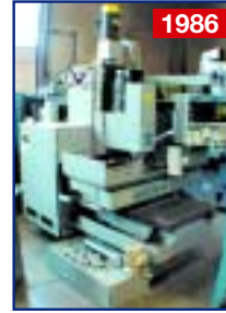
DAHLIH VERTICAL MACHINING CENTER, MDL. MCV520