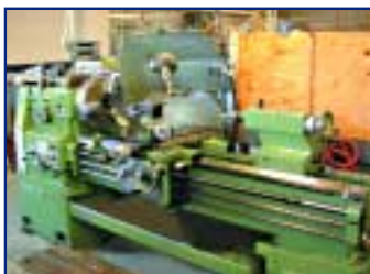
FERRO 20" X 60" GAP BED ENGINE LATHE, MDL. 20