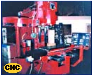
HURCO CNC VERTICAL MACHINING CENTER