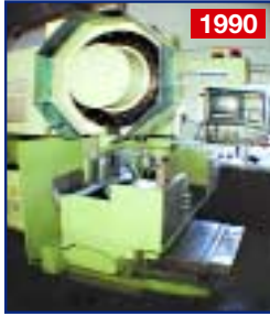
OKUMA VERTICAL MACHINING CENTER, MDL MC-4VAE