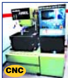
SODICK CNC WIRE-CUT EDM, MDL. A280L