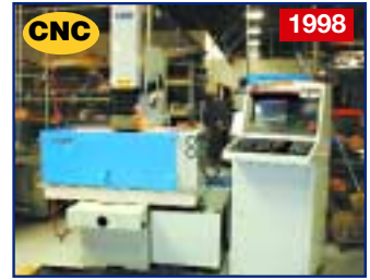
EDM SOLUTIONS RAM TYPE EDM, VANGUARD