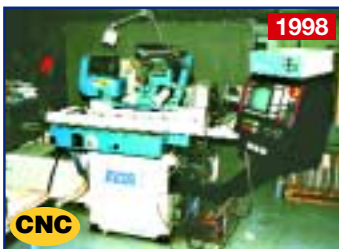
K.O. LEE CNC CYLINDRICAL GRINDER, MDL. C1020N2