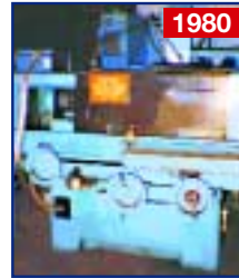
SHEFFIELD "CRUSHTRUE" FORM GRINDER, MDL. #187C