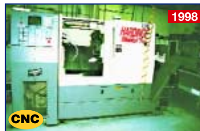
HARDINGE CONQUEST T51 CNC TURNING CENTER