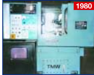
YUASA MICRO STAR 10 CNC GANG TOOL LATHE, MDL. 10144