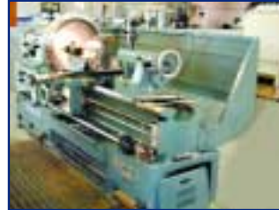
NAMSEON 24"/32" X 60" GAP BED ENGINE LATHE, MDL. 600X1500