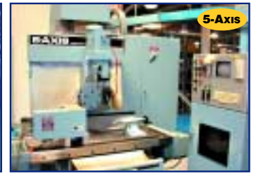
BOSTOMATIC (5) AXIS VMC, 514-1