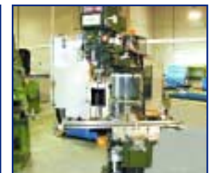
KENT VERTICAL MILLING MACHINE, MDL. KTM5VT