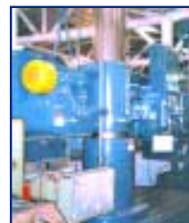
CARLTON RADIAL ARM DRILL, MDL. 4A