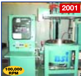
BARBOUR STOCKWELL SPIN TESTING MACHINE, MDL. 10100-200