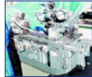
OKUMA UNIVERSAL CYLINDRICAL GRINDER, MDL. GCU 300-750