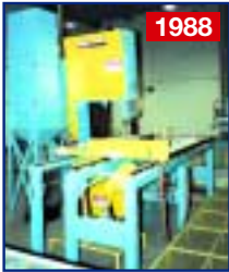
EDGE-SWEETS VERTICAL PLATE SAW, MDL. VR2-205-HOBE