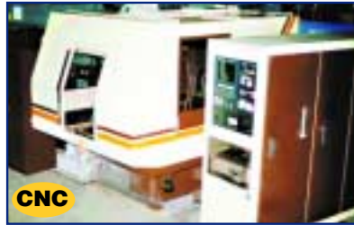
HUFFMAN 5-AXIS CNC TOOL & CUTTER GRINDER, MDL. HS-115R