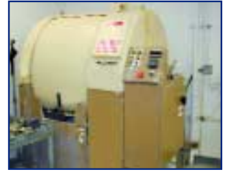
TIMESAVER ROTARY TUMBLER, MDL. H2 120