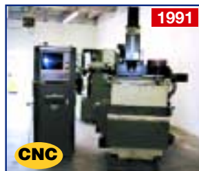
LEBLOND MAKINO CNC SINKER EDM SYSTEM, MDL. EDNC-32