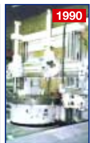
SCHIESS DEFRIES VERTICAL BORING MILL