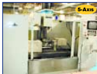
FADAL 4020 (5) AXIS VMC, MDL. VMC 4020