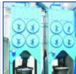
(2) TORIT DOWNFLOW DUST COLLECTORS, MDL. 2DF4 FOR DEBURRING ROOM