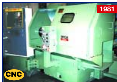
IKEGAI FX 30N CNC CHUCKER, MDL. FX30