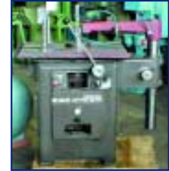
MITTS & MERRILL AUTOMATIC HYDRAULIC KEYSEATER, MDL. 4C