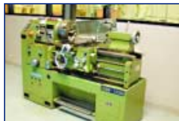
VICTOR 16" X 30" ENGINE LATHE, MDL. 1630