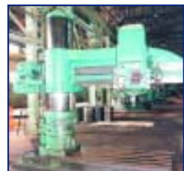
CARLTON RADIAL ARM DRILL, MDL. 4A