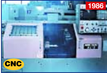
MORI SEIKI AL-2 CNC LATHE, MDL. AL-2BTM

THE ITEMS LISTED BELOW ARE LOCATED OFF SITE AND WILL BE SOLD VIA PHOTO & BIDCAST FROM THE AUCTION LOCATION. FOR ADDITIONAL INFORMATION, PLEASE CALL 818.508.7034