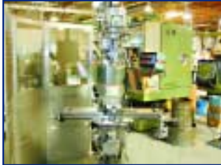
BRIDGEPORT VERTICAL MILLING MACHINE