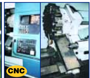
HES/TOYODA CNC TURNING CENTER