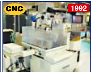
MITSUBISHI CNC WIRE EDM, MDL. DWC90C