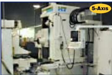
K & T (5) AXIS VMC, 600-5