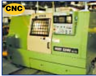
MORI SEIKI CNC LATHE, MDL. SL-25B500