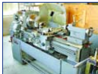
WEBB 15 3/4" X 40" ENGINE LATHE, MDL. 153/4X40