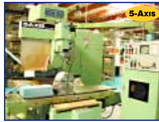
BOSTOMATIC 14-24 (5) AXIS VMC, MDL. 14/24