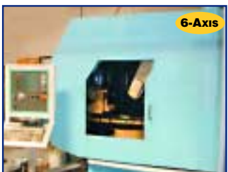
HUFFMAN (6) AXIS CNC TOOL & CUTTER GRINDER