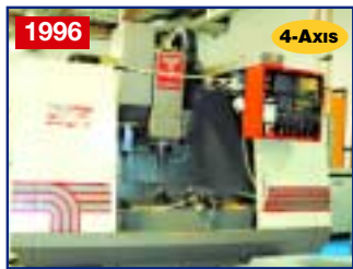
TREE KIRA (4) AXIS VMC, MDL. 200