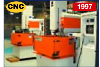
CHARMILLES RAM TYPE EDM, ROBOFORM 40,