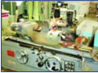
TOYODA UNIVERSAL OD/ID GRINDER, MDL. GU28-200