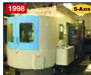
TOYODA (5) AXIS VMC, MDL. FA 550II