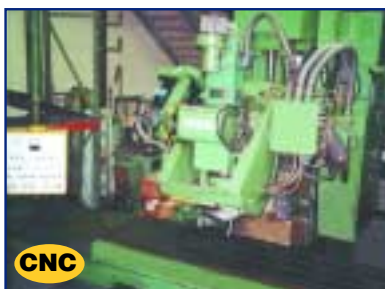
CINCINNATI MILACRON CNC HYDROTEL VERTICAL MILLING MACHINE, MDL. 20V-80