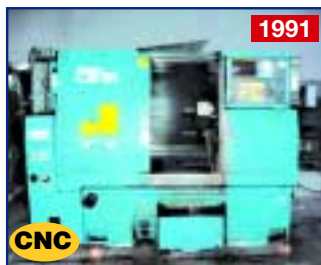
MİYANO CNC TURNING CENTER, MDL. LE-31