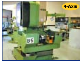
MORI SEIKI (4) AXIS VMC, MDL. MV JUNIOR