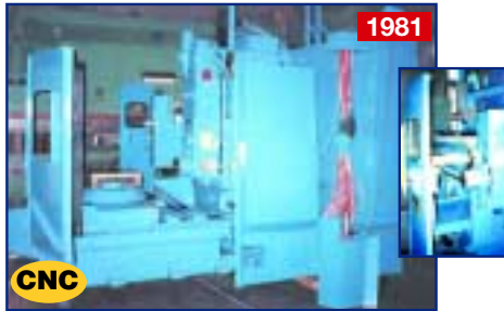
CINCINNATI-MILACRON CNC HORIZONTAL MACHINING CENTER, MDL. MA T-10