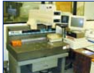
CORDAX CMM, MDL. 1505