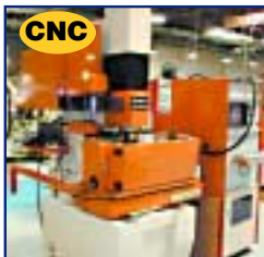
SODICK CNC RAM TYPE EDM, MDL. FSA3C-R