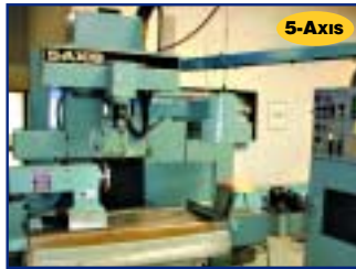
BOSTOMATIC (5) AXIS VMC, MDL. 412-4