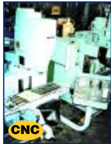
HURCO CNC VERTICAL MACHINING CENTER