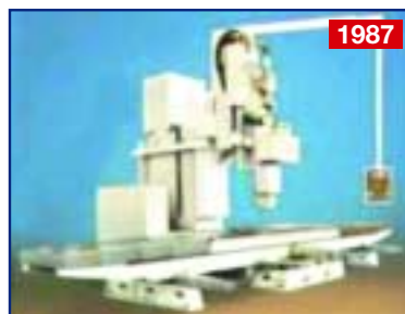
CINCINNATI 5-AXES VERTICAL CNC HONEYCOMB PROFILER, BED TYPE, MDL. 20V