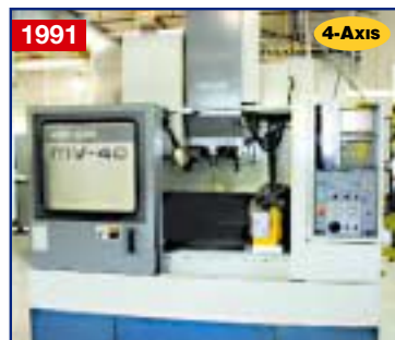
MORI SEIKI (4) AXIS VMC, MDL. MV40B