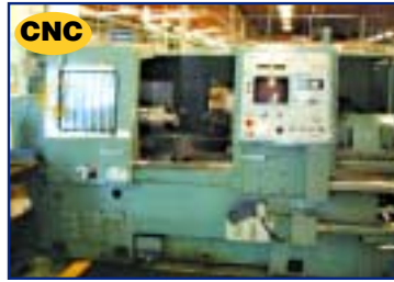
MORI SEIKI CNC LATHE, MDL. TL-5A