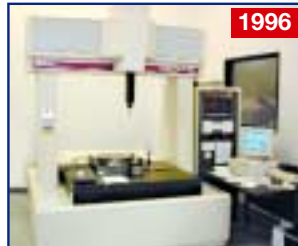
GIDDINGS & LEWIS CORDAX CMM, MDL. RS-70DC