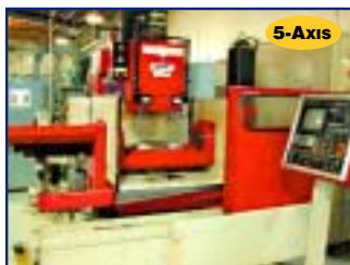
RIDGID (5) AXIS VMC, MDL. NF-100