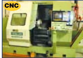
OKUMA CNC LATHE, MDL. LC-40-2ST