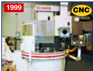
SCHIESS CNC VBM