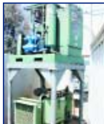
SULLAIR 25 HP ROTARY AIR COMPRESSOR