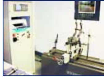
SCHENCK BALANCING MACHINE, MDL. H2BU