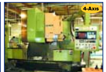
MORI SEIKI (4) AXIS VMC, MDL. MV35/40

To Schedule an Auction or an Appraisal, Call Our Studio City, CA Office at 818.508.7034.