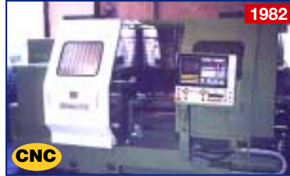
OKUMA 4-AXIS CNC LATHE, MDL. LC30