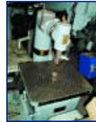
BOYAR SCHULTZ DUAL SPINDLE COLLET TYPE PROFILE GRINDER, MDL. #2