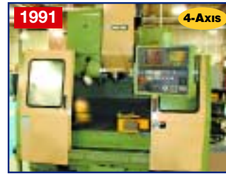
MORI SEIKI (4) AXIS VMC, MDL. MV40