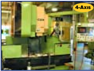
MORI SEIKI (4) AXIS VMC, MDL. MV35/40