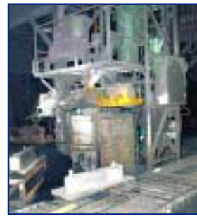
CE CAST 300 LB. NO-BAKE MOLDING SYSTEM