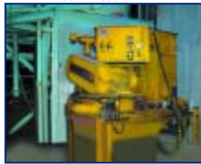
NFE MDL. 230 30 HP HYVAC VACUUM