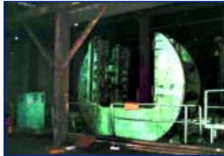
CLEVELAND MDL. 25090 25000LB. BARREL MOLD ROLLOVER