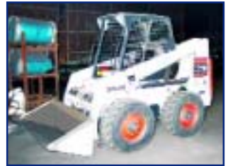
BOBCAT MDL. 863 SKID STEER LOADER