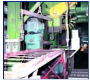
EMI OSBORN MDL. 722 RJWA ROLLER LIFT SEMI AUTOMATIC MOLDING MACHINE