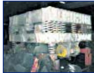
G/K MDL. TMKC 8'X8' TWIN MAST SHAKEOUT