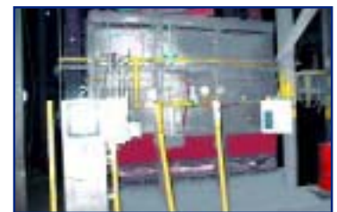
CAR BOTTOM TYPE HEAT TREAT FURNACE