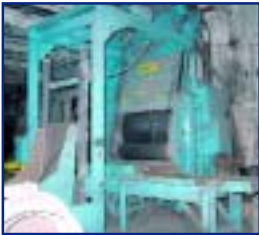
WHEELABRATOR 14 C.F. SUPER TUMBLAST W/LOADER