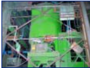
COMPLETE GREEN SAND SYSTEM INCLUDING SIMPSON 2F MULLER