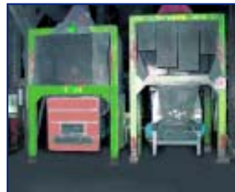
DEPENDABLE MDL. 6 TPH HLD VIBRACLASS LUMP CRUSHER