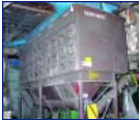
DUST HOG MDL. FJH60-3 CARTRIDGE DUST COLLECTOR