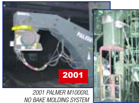
2001 PALMER M1000XL NO BAKE MOLDING SYSTEM