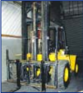
EAGLE MDL. R80 8000LB. DIESEL POWERED FORK LIFT TRUCK