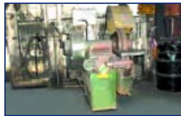
FOX MDL. 1230 24" SINGLE END GRINDER