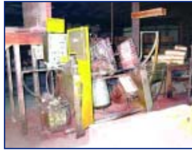
DEPENDABLE MDL. 400 FA SHELL CORE MACHINE