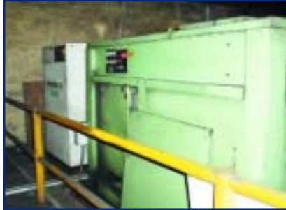
VIEW OF HIROSS DRYSTEM AIR DRYER & SULLAIR 150 HP SCREW TYPE AIR COMPRESSOR