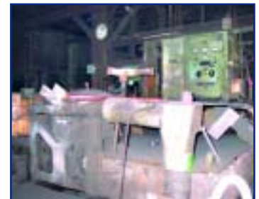
INDUCTOTHERM INDUCTOMATIC 300 TRILINE 300KW MELTING SYSTEM w/POWER SUPPLY