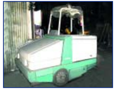
TENNET MDL. 385 L/P POWERED RIDING TYPE FLOOR SWEEPER