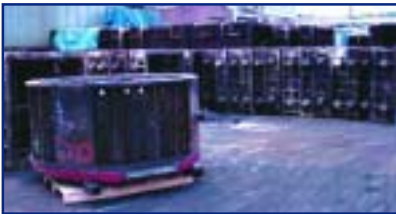
VIEW OF FLASKS