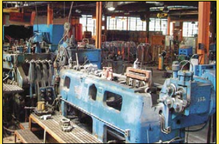
1" National 1000 Four Die Progressive Cold Former