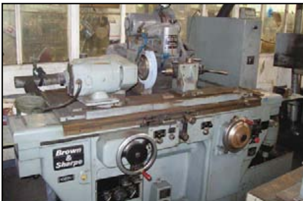
Brown & Sharpe Universal Grinder