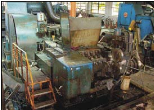
3/4" Waterbury Farrel #5 Hi-Pro Five Die High Speed Cold Nut-Parts Former