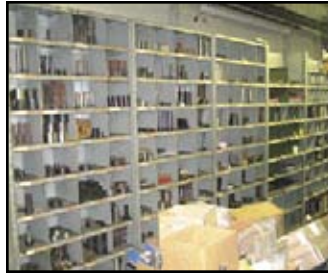
Cold Forming Tooling