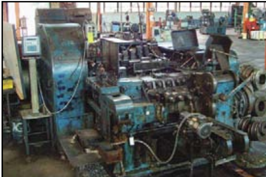
1/2" Waterbury Farrel Five Die Parts Former