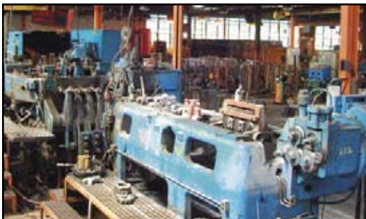
1" National 1000 Four Die Progressive Cold Former