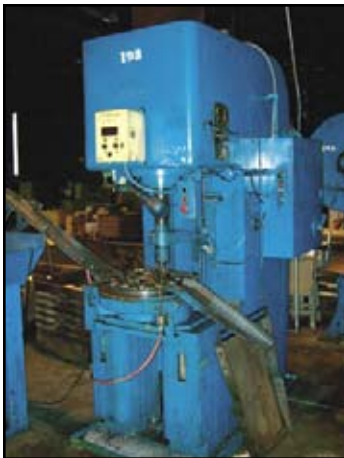
35 Ton Denison Hyd Press for 1" Hex Nut Top Lock