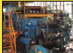
1" National Five Die Cold Nut-Parts Former Universal Transfer