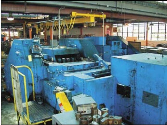
5/8" National 5-2 High Speed Nut Former