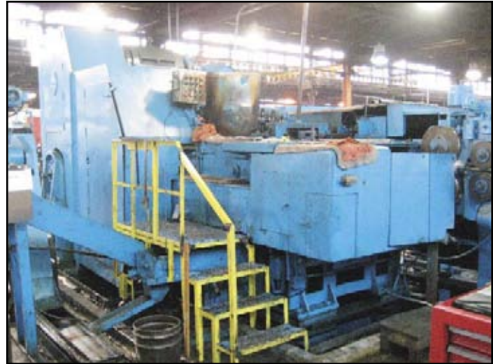
Waterbury #5 Hi-Pro Nut Former