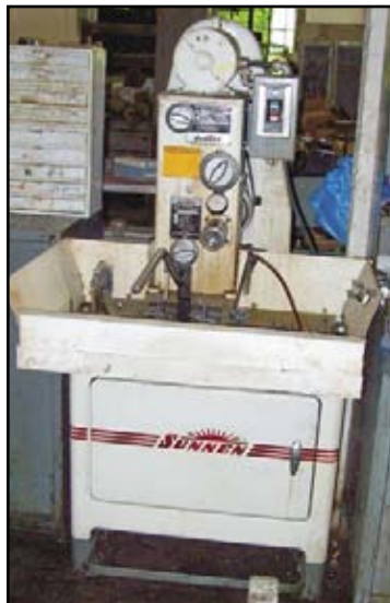
Sunnen Mdl. 1660 Hone