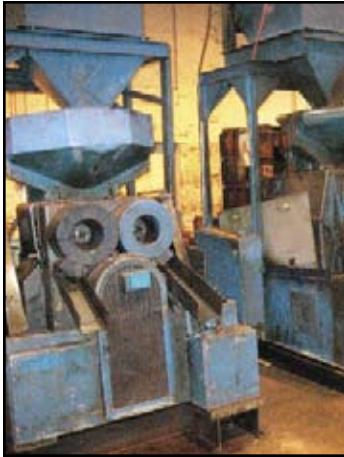
Nutap Nut Tappers