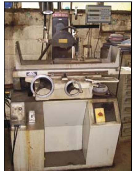
Harig Autostep 618 Surface Grinder

FOR LEASE & FINANCE SERVICES - BIDITUP CAPITAL CORPORATION