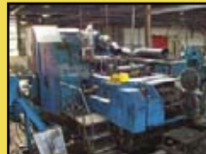
7/8" Waterbury Farrel #6 Hi-Pro Five Die High Speed Nut Former