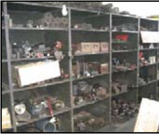
Cold Former Spare Parts