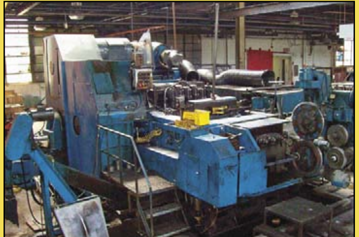
7/8" Waterbury Farrel #6 Hi-Pro Five Die High Speed Nut Former