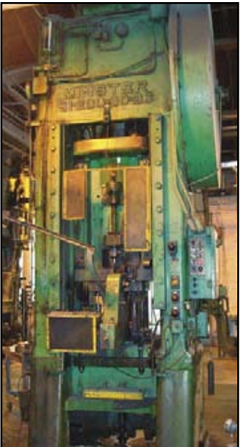
200 Ton Minster Straight Side Single Crank Press