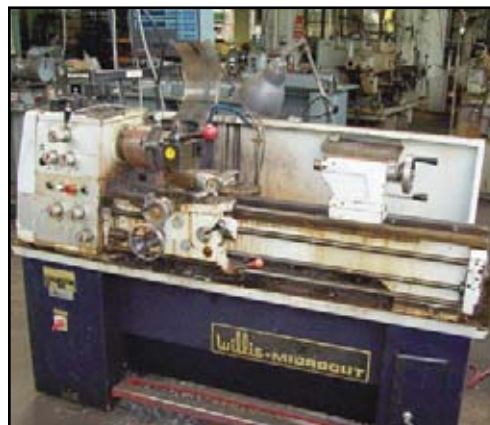
Willis Microcut Engine Lathe