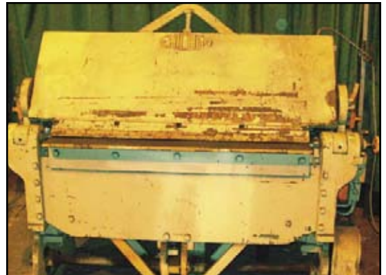
Chicago Bending Brake