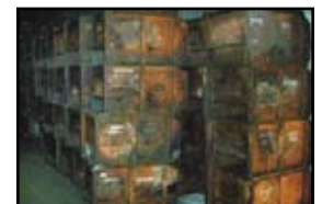
Steel Stackable Bins

Can't make it to the auction in person? Bid live online at