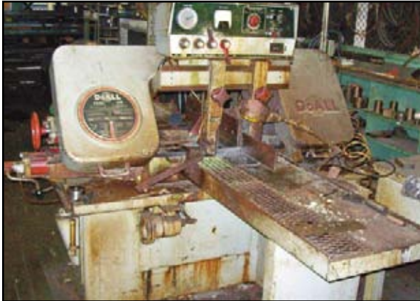
DoAll Horizontal Saw