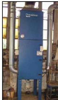
Donaldson Torit Dust Collector

From Cleveland-Hopkins International Airport: Travel east on 480 to I-77 (Exit 20). Travel south on I-77 to Junction 76 (east). Continue east on 76 to Tallmadge Road (Exit 31). Turn left (west) onto Tallmadge Road and travel under freeway overpass to immediate light for Mogadore Road. Turn right onto Mogadore Road (Highway 81). Travel north on Mogadore Road (Highway 81) for 3.3 miles to plant on left side.