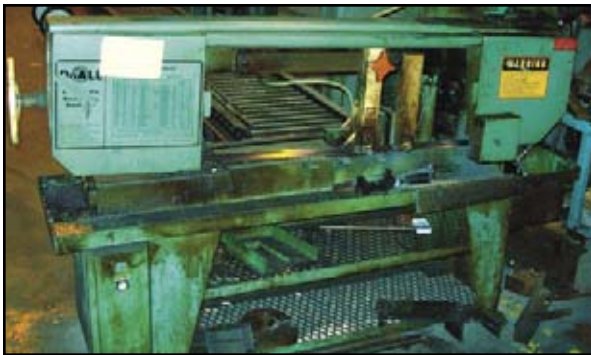
DoAll C916 Horizontal Band Saw

Sunnen MDL. 1660 , ID Range .060"--6.5", Length 1/8"--16", Sunnen Tooling, S/N 81678