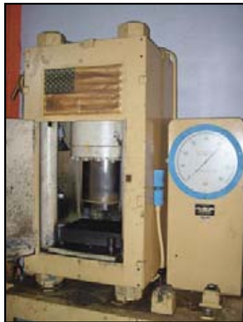
400 Ton Service Physical Hydraulic Hobbing Press