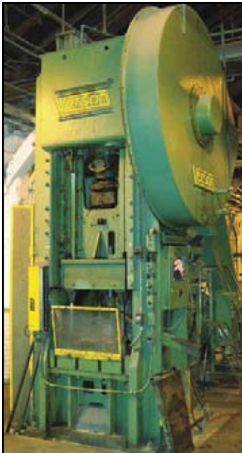
215 Ton Verson Straight Side Slug Feed Press