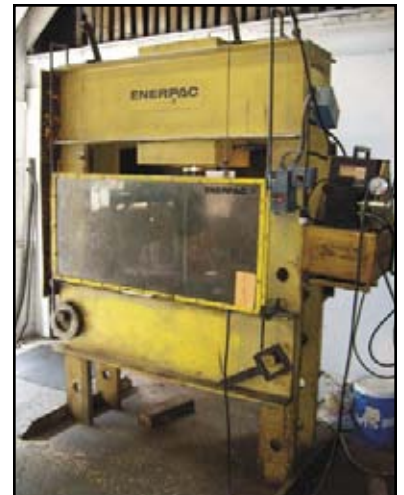
200 Ton Enerpac H-Frame Press