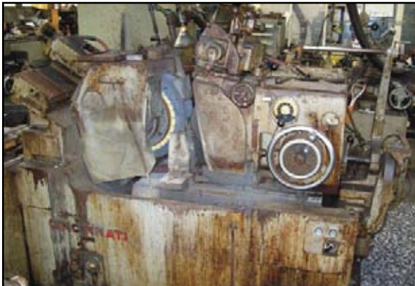
Cincinnati Centerless Grinder