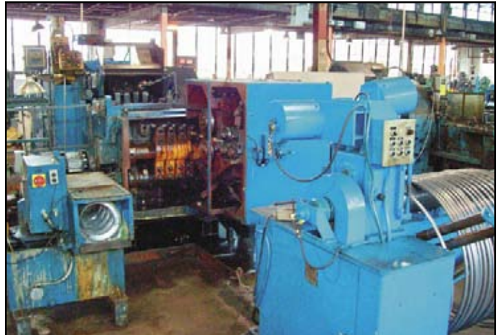
1/2" National S-2 High Speed Cold Nut Former