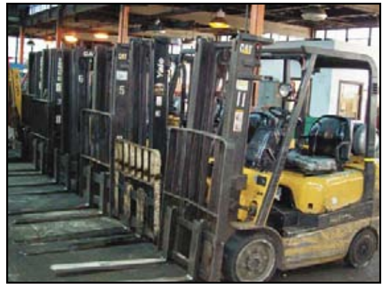
View Lift Trucks

Assortment of National and Waterbury Farrel Hand Made Wooden Mold Patterns for Cast Machine Parts