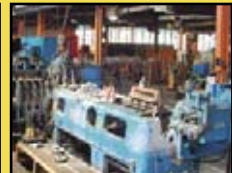
1" National 1000 Four Die Progressive Cold Former