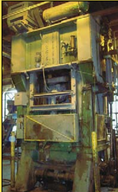
400 Ton Minster Hevi-Stamp Press