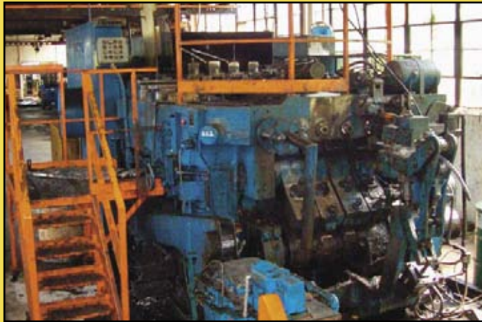
1" National Five Die Cold Nut-Parts Former Universal Transfer