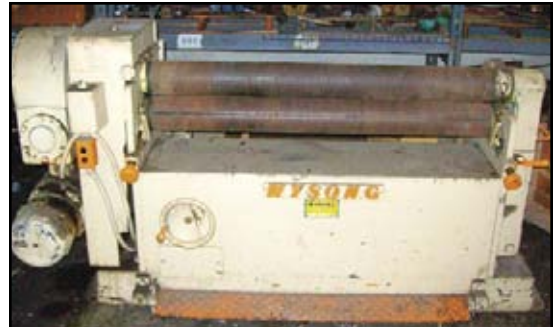
Wysong 4' x 8 Gauge Plate Bending Roll