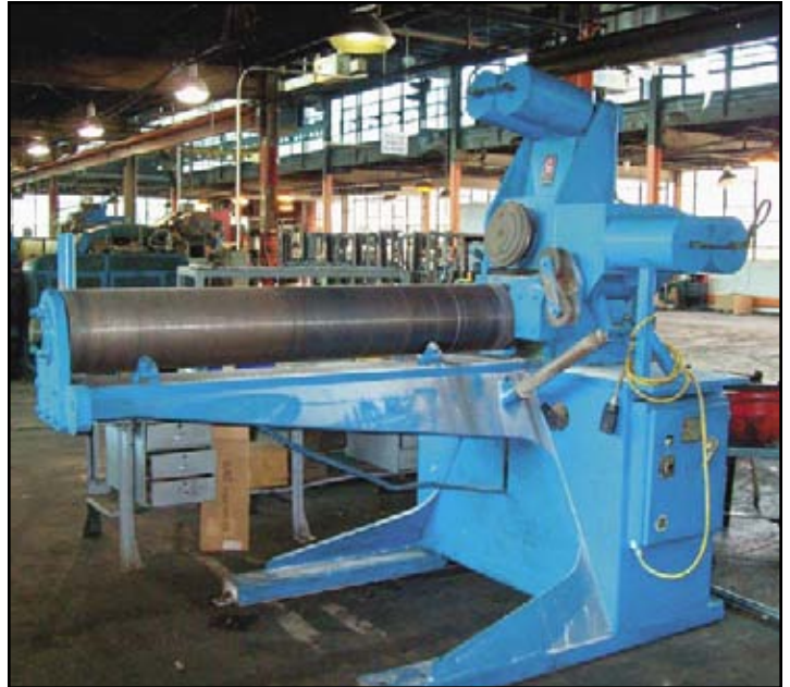
2" Fastener Engineers 6,000 Lb. Uncoiler