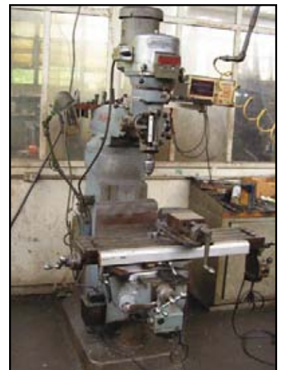
Bridgeport Vertical Mill

LEASE/ FINANCING AVAILABLE DIRECT FROM BIDITUP Capital Corporation