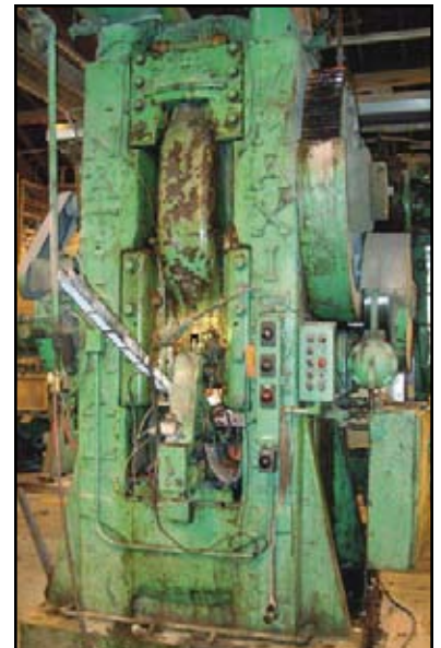
700 Ton National Maxi Press