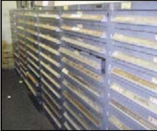
Over (50) Vidmars With Cold Former Tooling