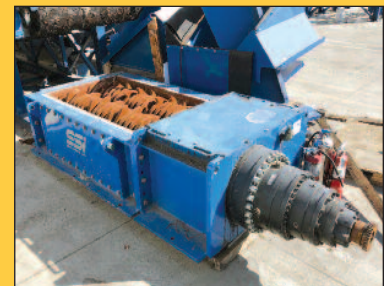
SSI M100E(63) Shredder

Complete Photos & Lot Listings at www.biditup.com