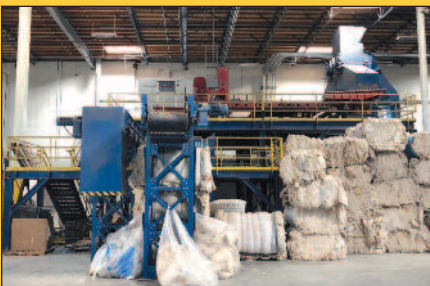
Optical Sorting System