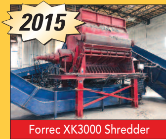
Forrec XK3000 Shredder