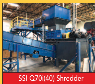
SSI Q70i(40) Shredder