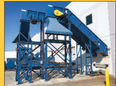
Mayfran Conveyor (Outside View)