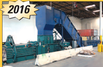
Maren ProPak A235 Horiz. Auto Tie Baler