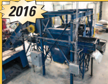
Dings 55T Magnetic Separator