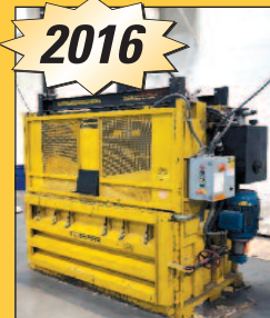
Harmony Vert. Baler