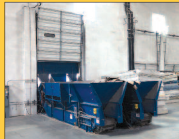
Mayfran Conveyor (Inside View)