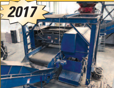
Dings 99T Magnetic Separator