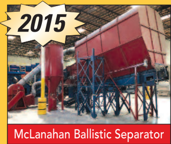
McLanahan Ballistic Separator